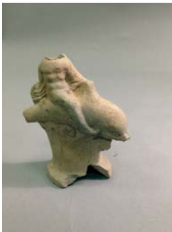
Figure 6: 78.AD.271.4 (reference image), 10.2 x 8.2 cm