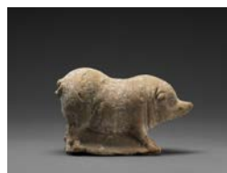
Figure 31: 78.AD.346, 8.3 x 5.4 x 13.5 cm

78.AD.345: Woman holding a child up in front of her left shoulder; fifth century BC; reportedly from Gela.