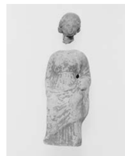
Figure 14: 71.AD.345, H: 4.5 cm

71.AD.345: (fig. 14) Seated goddess, probably Persephone, wearing an epiblema and a chiton, with her head tilted to the left; traces of polychromy are visible on the surface; third century BC.