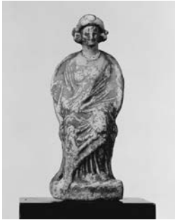
Figure 15: 71.AD.346, H: 16.3 cm