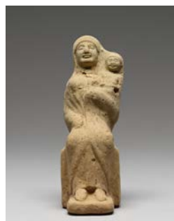
Figure 30: 71.AD.347, 11 x 3.8 x 6 cm

71.AD.141: (fig. 29) Seated woman wearing a veil and holding on her lap a child who faces forward; sixth–fifth centuries BC; reportedly from Gela.