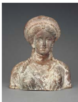
Figure 28: 70.AD.120, 25.7 x 22.2 cm

70.AD.120: (fig. 28) Bust of a woman with coiled locks of hair falling forward over her shoulders, wearing a diadem and necklace, perhaps Persephone; white slip and traces of polychromy, with a circular vent hole in the back of the head and square notch in the rear lower edge of the bust; 300–200 BC; probably from Centuripe.