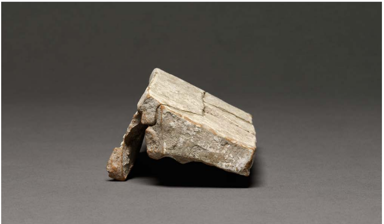
Side view from proper left