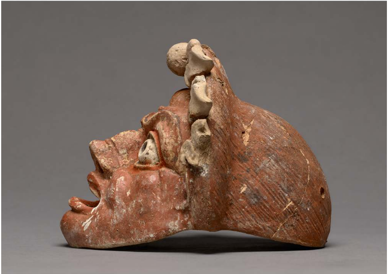
Side view from proper left