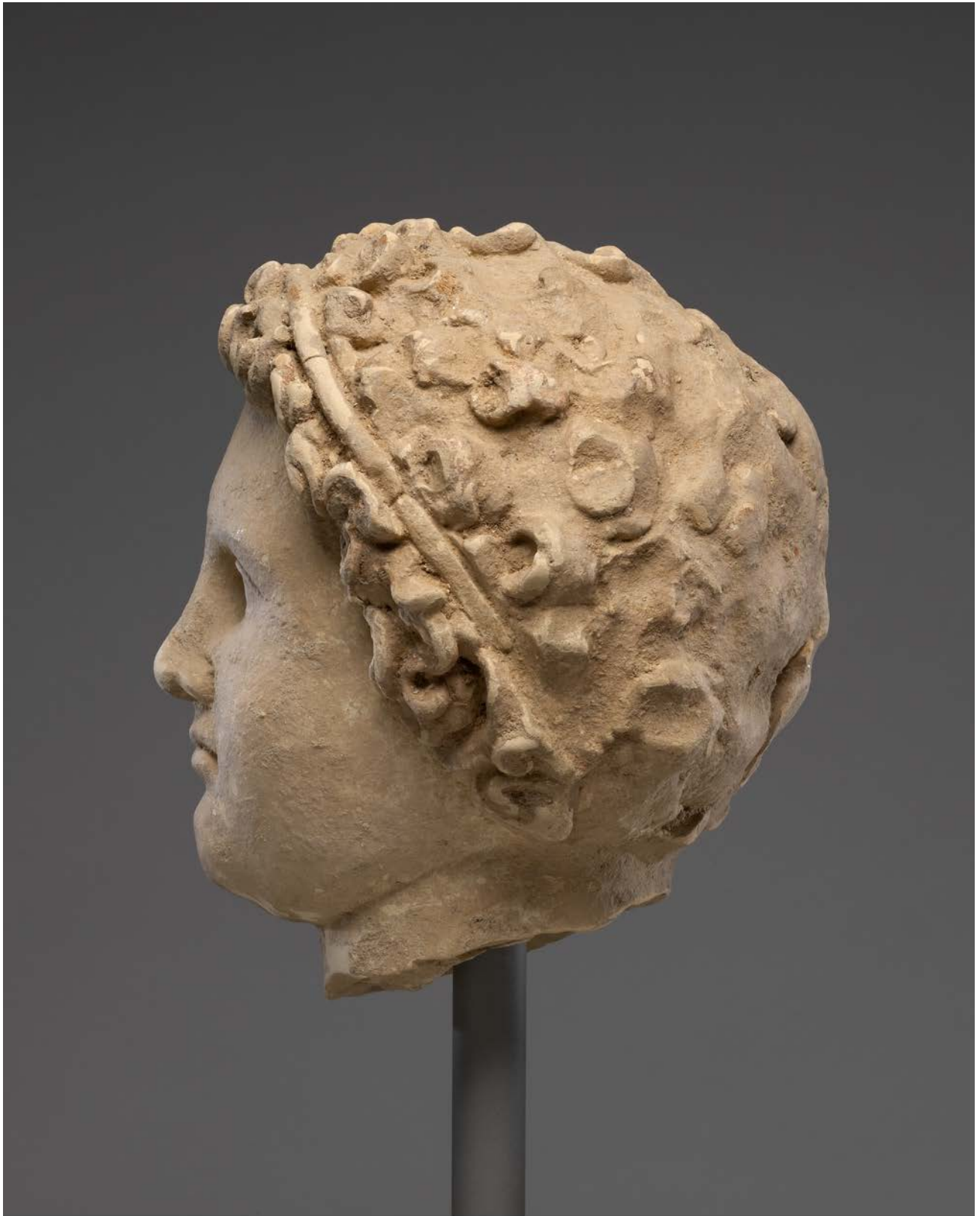
Profile from proper left