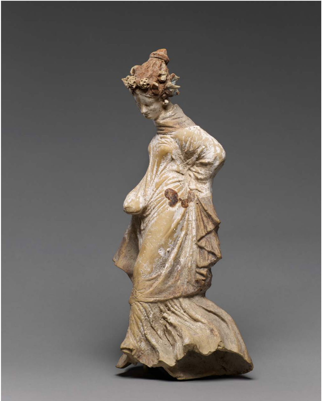
Three-quarter from proper left