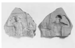
Figure 12: 75.AD.45, H: 12.5 cm

BC. See KINGSLEY 1976, p. 7, no. 13, pl. 13; KINGSLEY 1981, pp. 50–51, no. E.10 (incorrectly cited as 74.AD.44); figs. 3 and 13; and FERRANDINI TROISI, BUCCOLIERO, AND VENTRELLI 2012, p. 184, no. 44 (incorrectly cited as 74.AD.44).