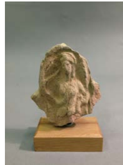
Figure 18: 78.AD.404 (reference image), H: 8.7 cm

78.AD.404: (fig. 18) Votive relief with head and torso of Aphrodite rising from the waves; third century BC. South Italian?