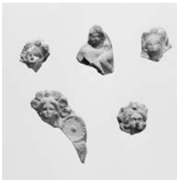
Figure 5 (clockwise from top left): 75.AD.40.H.2; 75.AD.40.A.1; 75.AD.40.N.5; 75.AD.40.I.14; 75.AD.40.I.19. The largest object, 75.AD.40.I.19, is 8.8 cm high.