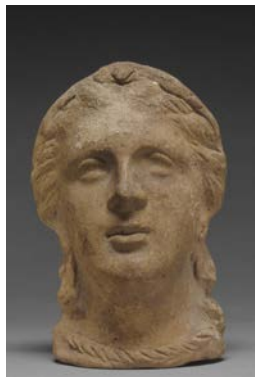
Figure 21: 71.AD.306, H: 19 cm

71.AD.305: (fig. 20) Head of a woman, with disc earrings and a veil covering the back portion of the head, from the same mold generation as an identical head in the Museo Campano in Capua, dated 300–275 BC. See SMITHERS 1993, p. 24, fig. 14.