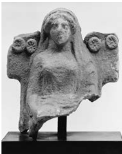
Figure 16: 71.AD.358, 13.5 x 12 cm

71.AD.346: (fig. 15) Goddess seated on a high, round-backed throne, wearing a chiton, himation, and stefane with a central ornament; large loops of hair at each ear; third century BC.