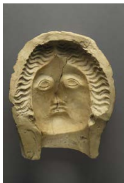
Figure 10: 71.AD.363, 25 x 21.5 cm

Thirty-nine molds depict types that belong to the repertoires of Tarentine and, more generally, South Italian terracottas. Seven molds acquired in 1973 were part of a group of 430 fourth-century BC terracottas, mainly representing female heads (see 73.AD.10 under “South Italy”). In 1974, 1975, and 1976, three groups of Tarentine molds came to the Getty from the collection of Norman Neuerberg. These molds produced figurines in the round and reliefs for decorative appliqué. Four examples are marked with the names or monograms of Tarentine coroplastic workshops.