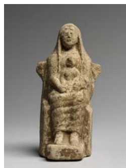
Figure 29: 71.AD.141, 13.6 x 6.9 x 6.5 cm

70.AD.120: (fig. 28) Bust of a woman with coiled locks of hair falling forward over her shoulders, wearing a diadem and necklace, perhaps Persephone; white slip and traces of polychromy, with a circular vent hole in the back of the head and square notch in the rear lower edge of the bust; 300–200 BC; probably from Centuripe.