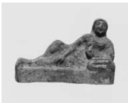
Figure 7: 78.AD.344, 9.5 x 14.6 cm

75.AD.37: (fig. 4) Male banqueter, bearded, reclining and holding a cup, with a vertical tang to hold the figure upright; fourth century BC. See KINGSLEY 1976, p. 5, no. 4, pl. 4.