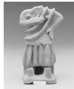
Figure 27: 82.AD.52.133, 20 x 11.2 cm

82.AD.52.1–153: A large group of votives was donated in 1982 and reportedly comes from Campania. Many of the figures are fragmentary and show evidence of burning. The