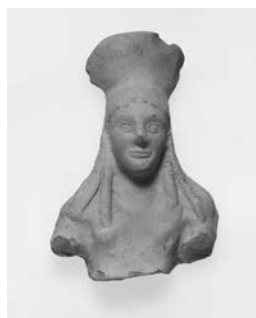
Figure 13: 77.AD.75, 12.3 x 8.4 cm

77.AD.75: (fig. 13) Upper body of a woman or goddess wearing a polos and with long locks of hair over her shoulders; sixth century BC; possibly made in Metaponto.