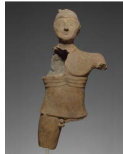
Figure 22: 82.AD.52.1, H: 56 cm

71.AD.306: (fig. 21) Head of a woman, wearing a veil, a fillet with a central bead, and a coiled torque necklace; stylistically similar to heads in Capua and Cales; 300–250 BC. See SMITHERS 1993, p. 25, fig. 17.