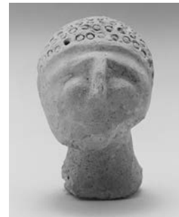
Figure 25: 82.AD.52.128, H: 7.1 cm