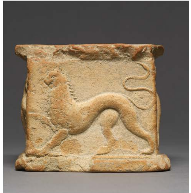
Profile from proper left