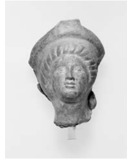
Figure 8: 80.AD.74, H: 9 cm

78.AD.344: (fig. 7) Reclining male banqueter; early fifth century BC.