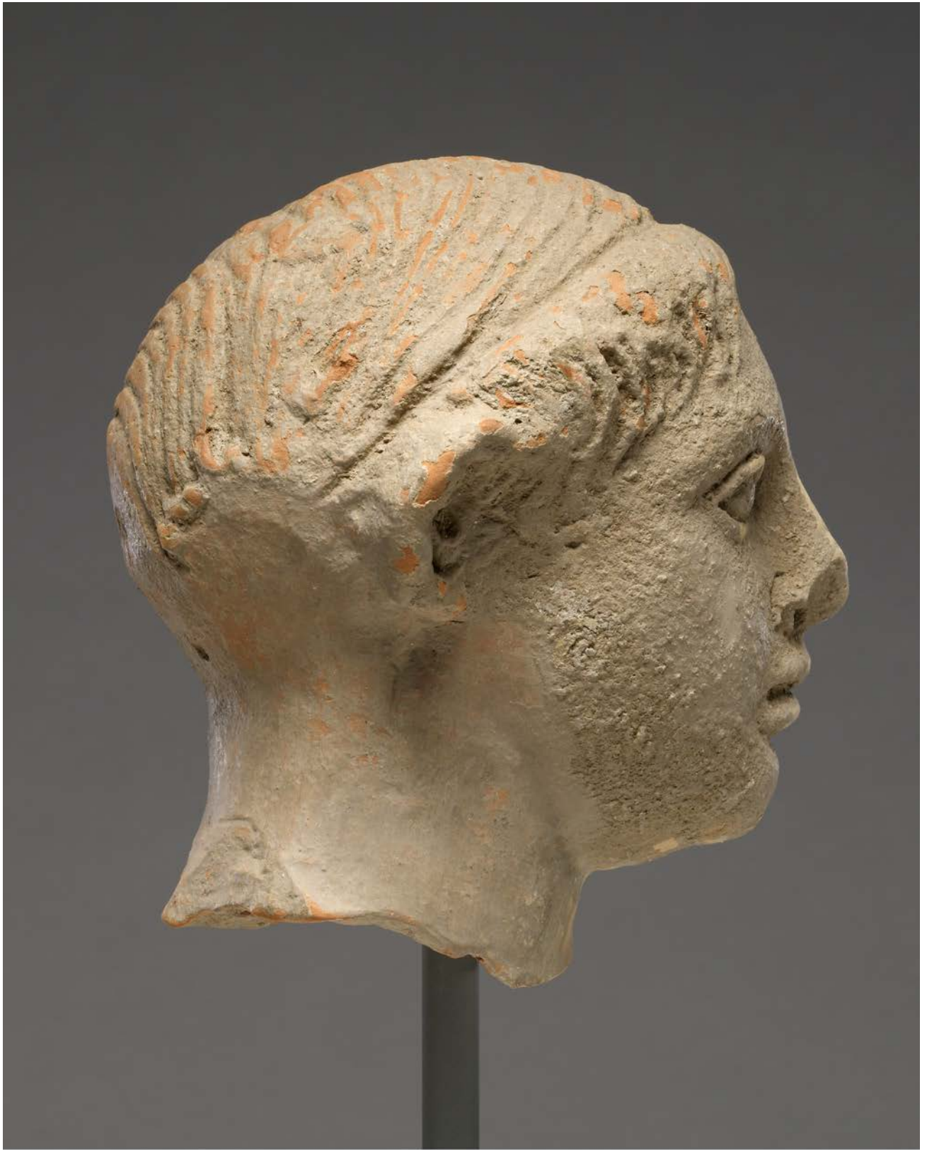
Profile from proper right