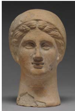
Figure 19: 71.AD.304, H: 22.2 cm

71.AD.304: (fig. 19) Head of a woman, with melon coiffeur and veil, and a long neck-incised Venus ring; from a mold series found at Capua; ca. 250–200 BC. See SMITHERS 1993, p. 26, fig. 18.