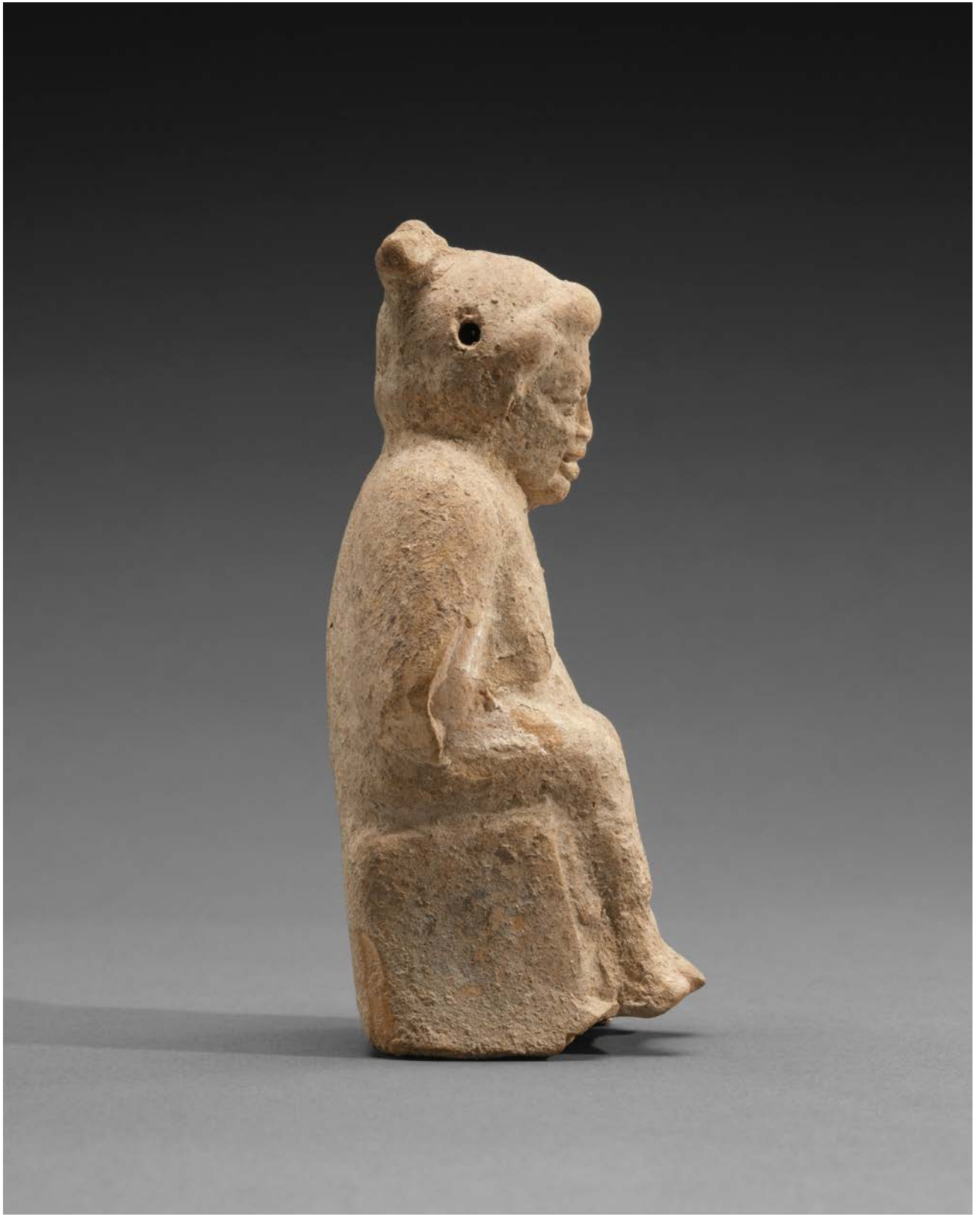
Side view from proper right