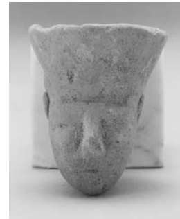
Figure 23: 82.AD.52.10, H: 5.7 cm