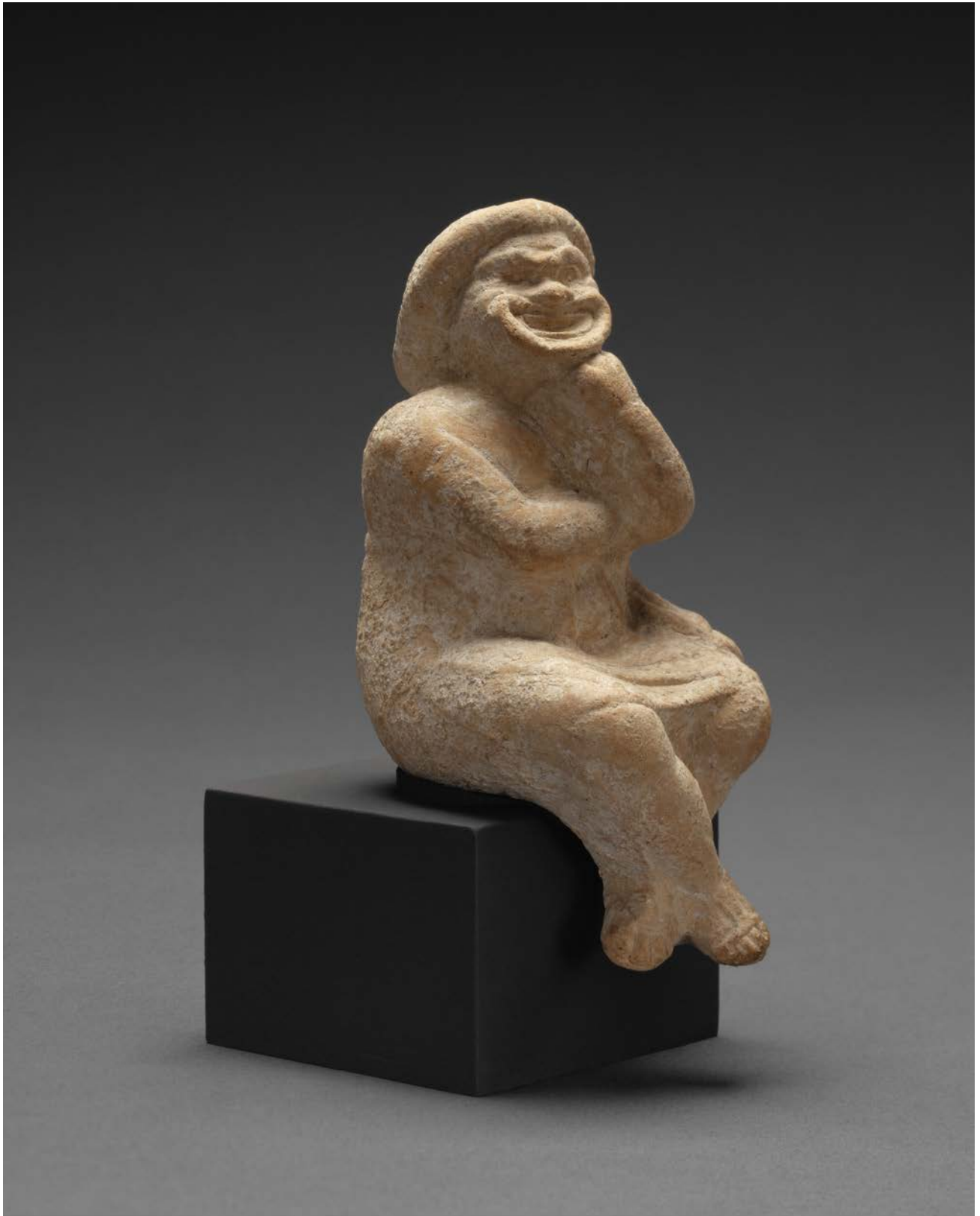
Three-quarter view from proper right