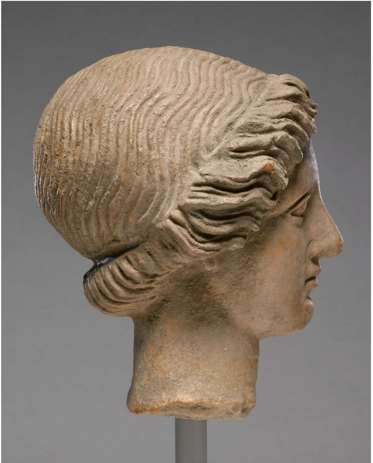
Profile from proper right