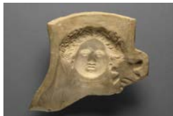
Figure 11: 75.AD.44, H: 17.8 cm

75.AD.43: Reclining male banqueter holding a rhyton in his left hand, right hand resting on his right knee; Tarentine; late sixth–fifth century BC. See KINGSLEY 1976, p. 4, no. 2, pl. 2; and B. M. Kingsley, “Reclining Heroes of Taras,” pp. 201–20, pl. 1.1–2.