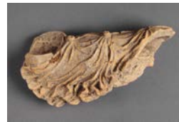
Figure 9: 83.AD.354.15, L: 22.5 cm

80.AD.74: (fig. 8) Head of a young woman wearing a polos ; late fifth century BC.