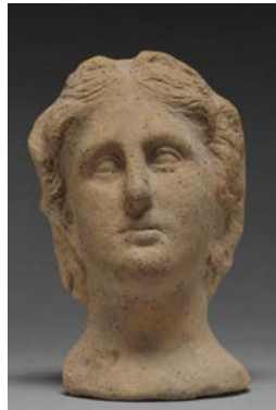
Figure 20: 71.AD.305, H: 20 cm