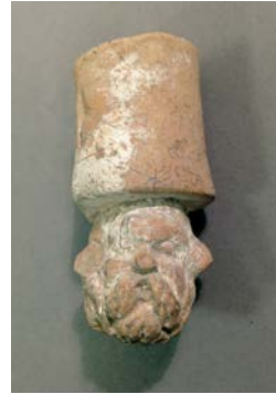
Figure 17: 78.AD.271.24 (reference image), 6.9 x 4.4 cm

Italian, and Gnathia pottery sherds. In addition to the seven South Italian molds listed above, the lot is almost exclusively composed of female heads, fragmentary figures, and a small number of male heads, fifty-five of which are identified as “Greek” types. Of the fifteen discoid or horse-shoe loom-weights (73.AD.10.I.1–15), several have figural reliefs, with images of a kneeling child holding an animal, Eros on a dolphin, Aphrodite riding a swan, an owl with arms holding a distaff over a kalathos, frontal head of a woman, and two facing busts (the so-called kissers type). The loom-weights belong to a series regularly found at sites in the region of Taranto, Metaponto, and Herakleia, beginning in the second half of the fourth century BC. If they belong with the accompanying group of votive heads, an origin in one of the Greek settlements along the Ionian coast is likely.