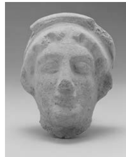
Figure 24: 82.AD.52.70, 15 x 19.1 cm