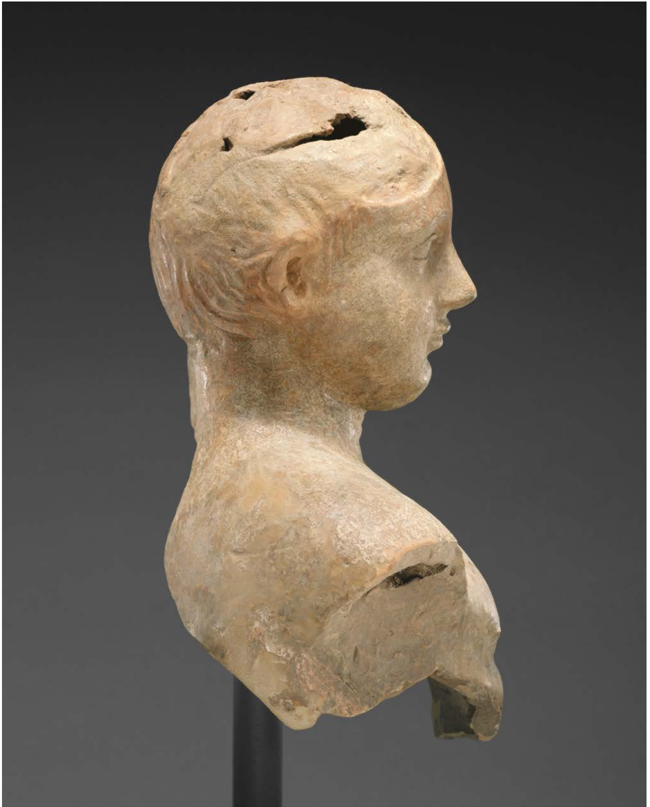
Side view from proper right