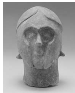
Figure 26: 82.AD.52.129, H: 19.6 cm