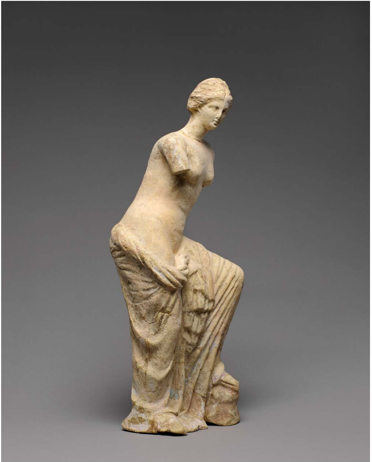
Three-quarter view from proper right