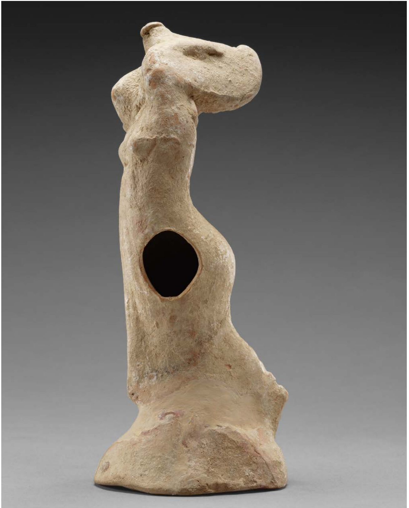
Side view from proper left