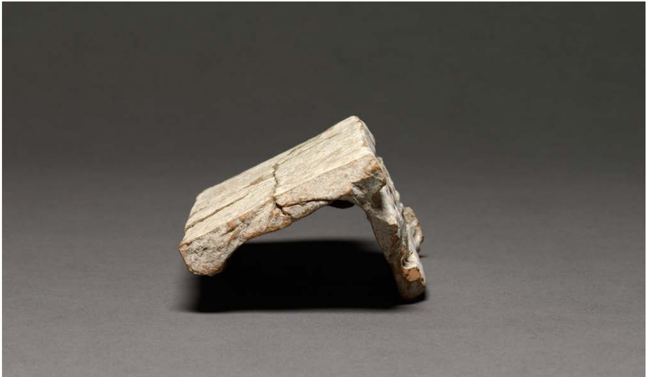
Side view from proper right