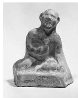
Figure 2: 71.AD.339, H: 8 cm

71.AD.311: (fig. 1) Banqueting couple; late fourth–third century BC. See KINGSLEY 1976, p. 6, no. 10, fig. 10; and B. M. Kingsley, “The Reclining Heroes of Taras and Their Cult,” California Studies in Classical Antiquity 12 (1979), p. 205, n. 75.