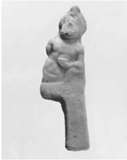
Figure 4: 75.AD.37, H: 17.5 cm