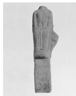
Figure 3: 75.AD.36, H: 16.8 cm

71.AD.339: (fig. 2) Crouching satyr with protruding ears, looking upward with his right hand on his chest; early fourth century BC.