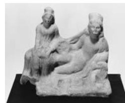
Figure 1: 71.AD.311, 9.7 x 10.7 cm

71.AD.311: (fig. 1) Banqueting couple; late fourth–third century BC. See KINGSLEY 1976, p. 6, no. 10, fig. 10; and B. M. Kingsley, “The Reclining Heroes of Taras and Their Cult,” California Studies in Classical Antiquity 12 (1979), p. 205, n. 75.