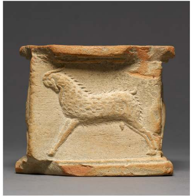
Profile from proper right