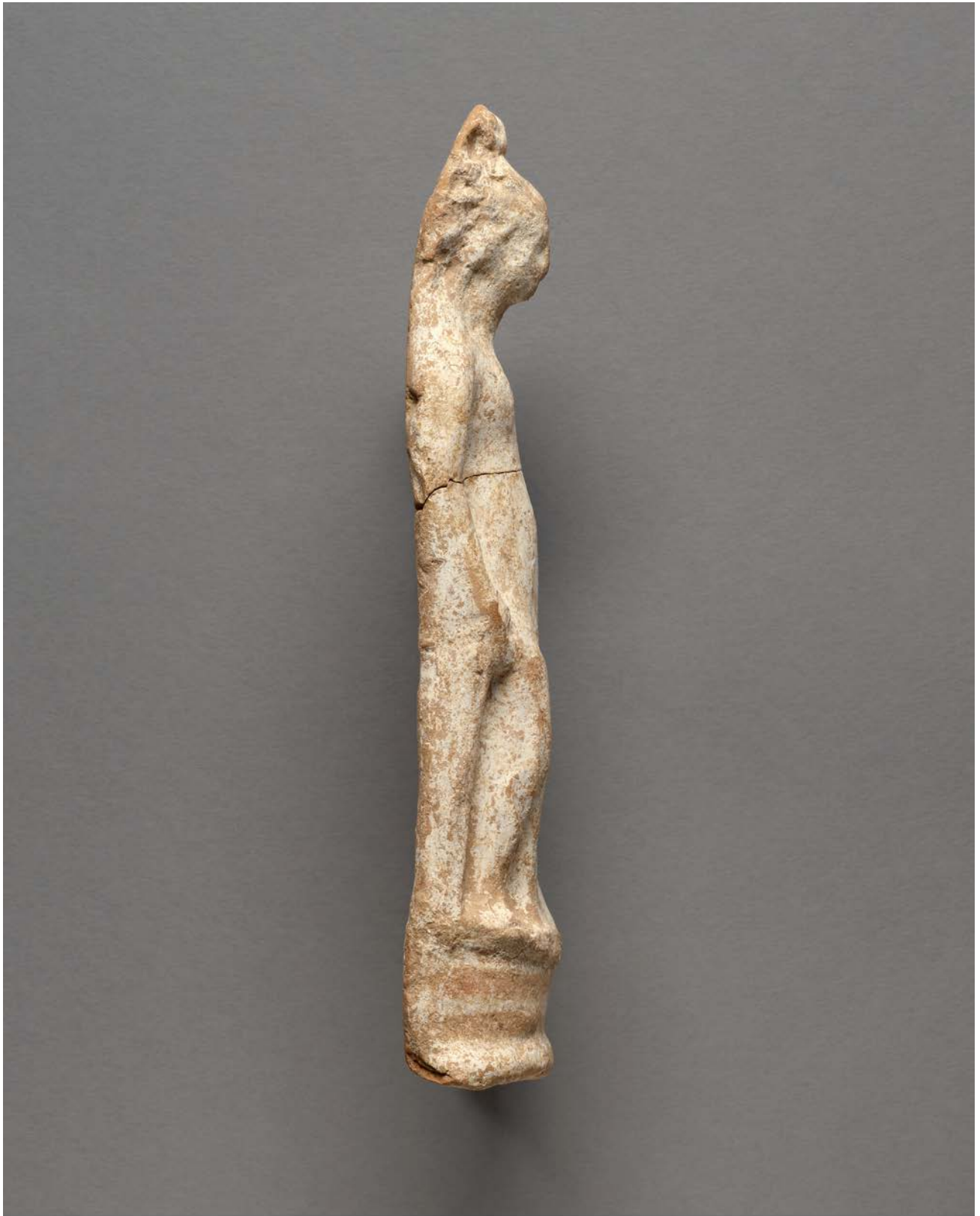
Side view from proper right