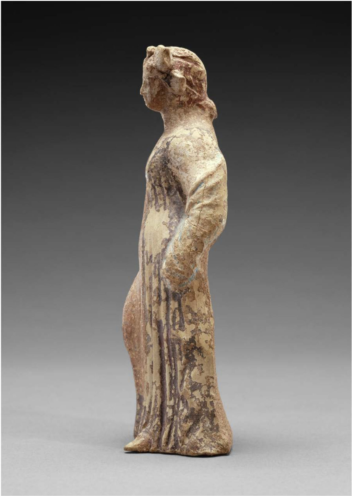
Side view from proper left