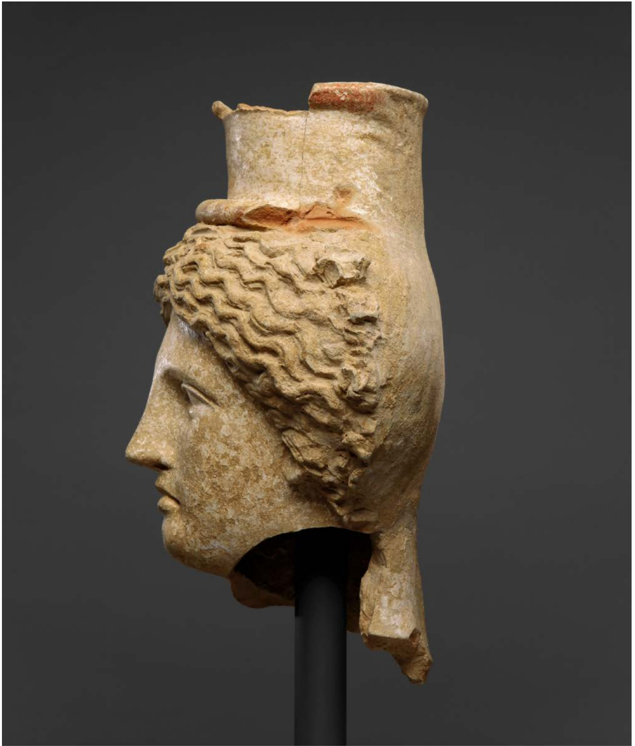
Profile view, right