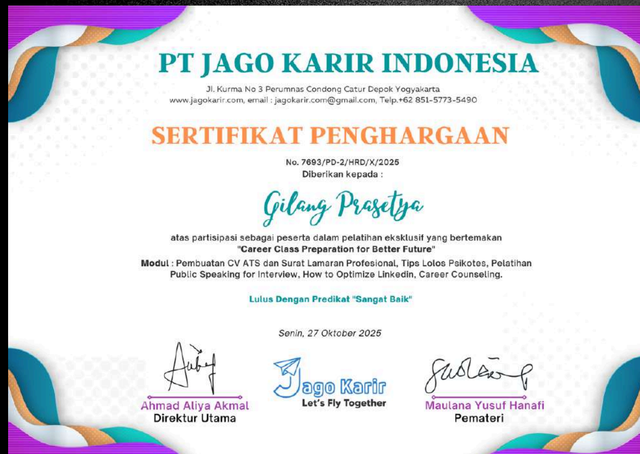
Pelatihan Eksklusif "Career Class Preparation for Better Future", PT Jago Karir Indonesia, 2025.