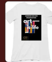
Official T-Shirt Rs-799