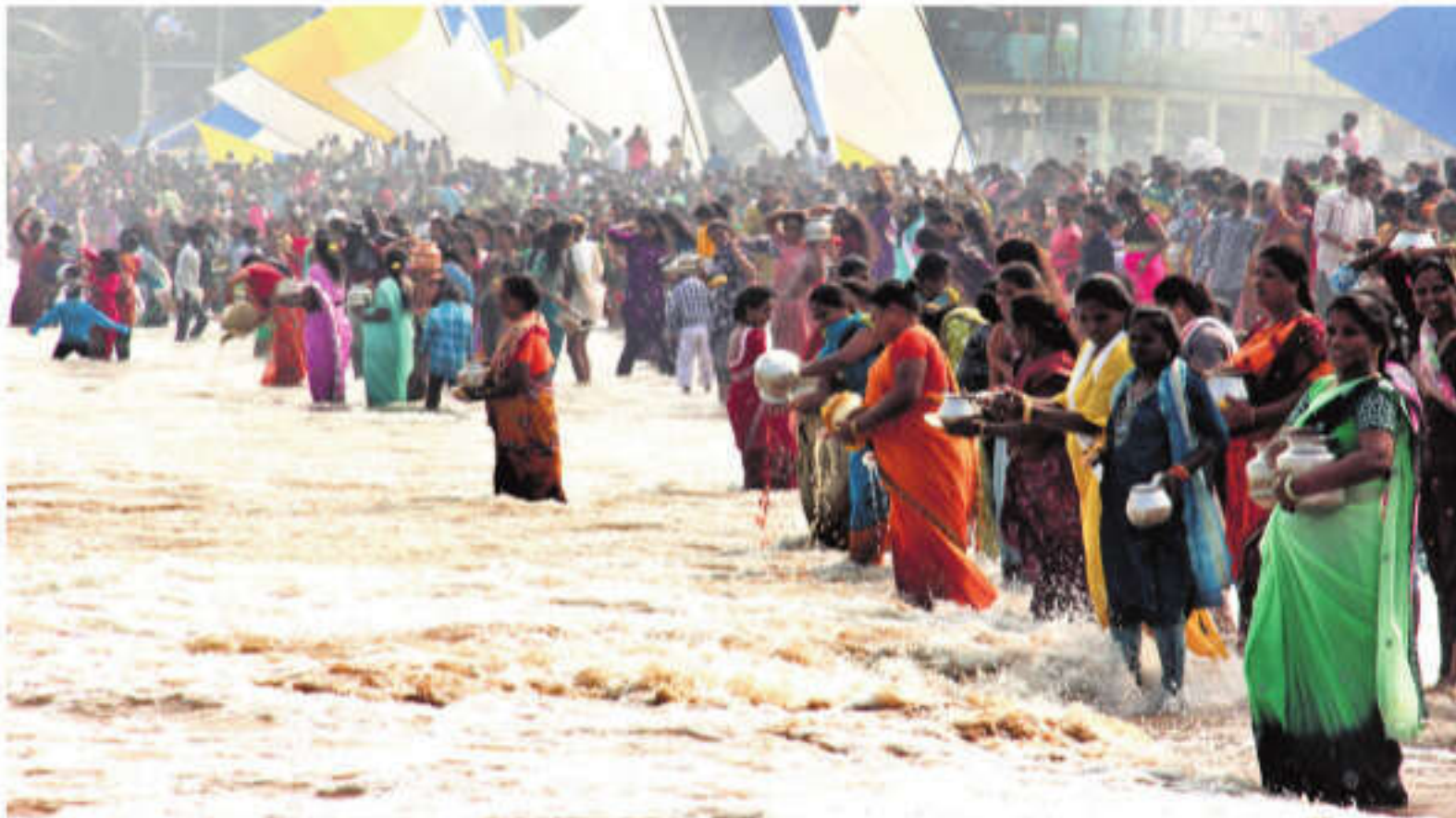
Women perform Ganga Puja at Pedajalaripeta in Vizag on Friday to mark the 21st Tsunami anniversary

"The SIM box connected to this broadband converted international calls into local GSM calls, and routed them through multiple Indian SIM cards installed in the SIM box to various mobile network towers. As a result, the call received by the victim appeared to be from the Indian number, and people are being cheated in the name of OTP and job scams, investment frauds and other crimes," he said. P4