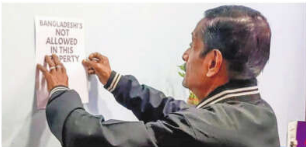
A hotel owner in West Bengal's Siliguri pastes a notice banning Bangladeshis | P11

Reports say thousands of Indians have been affected with several people who travelled to India specifically to renew their visas being stranded.