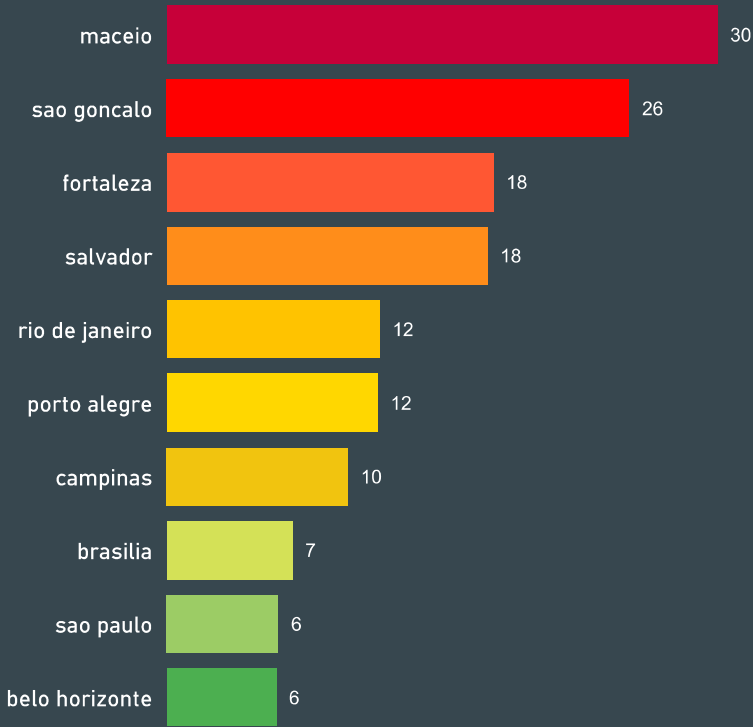
Logistics Efficiency: Regional Delay Hotspots