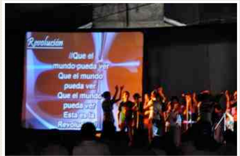
EVANGELISTIC EVENT IN SANTA CRUZ - APRIL 2009

Before we can move any further ahead, we must raise enough finances to be able to put a roof on the building that we're renting, buy a sound system, more chairs, advertise, etc. That is my goal while I am home.