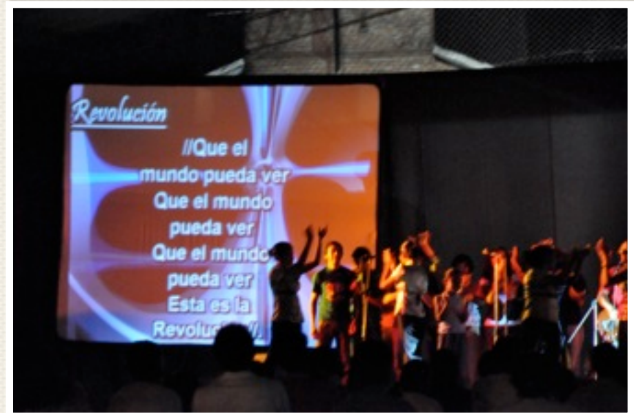
EVANGELISTIC EVENT IN SANTA CRUZ - APRIL 2009

Before we can move any further ahead, we must raise enough finances to be able to put a roof on the building that we're renting, buy a sound system, more chairs, advertise, etc. That is my goal while I am home.