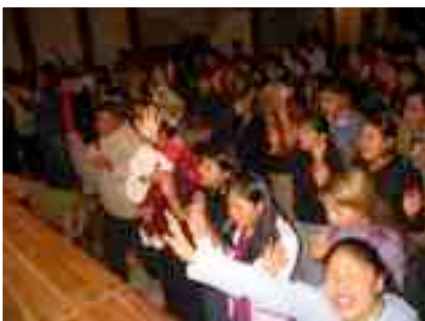
WORSHIP IN SUCRE