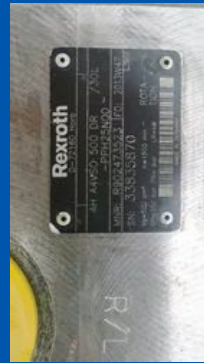
A4vso 500 Dr Rexroth Repairing