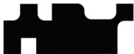
ABINGDON BUISNESS PARK