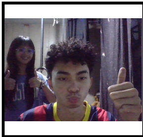
APPLICANT PHOTO APPLICANT THUMBMARK

Issued this February 04, 2026 , at Barangay Krus Na Ligas, District IV, Quezon City.