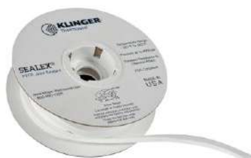
KL2.28.140.10.00.005 CINTA PTFE EXT. 10MMX3MM X15M