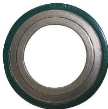
JE304150112 JUNTA ESPIRALADA SS 304 150 # 1.1/2"