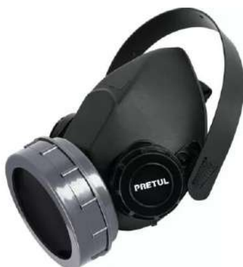
TR23390 RESPIRADOR PROFES. SIN CARTUCHO