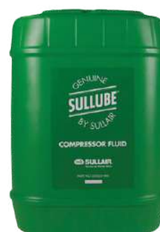
250022-669 ACEITE SULLUBE 32 - 5 GAL