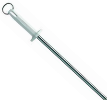
STBKW408-12 CHAIRA 30CM (12") MANGO C/ASTA LISA