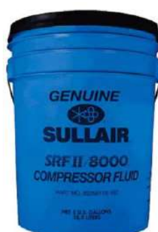
SU02250118-163 ACEITE SRF II/8000 5 GAL.