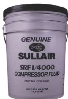
SU250023-974 ACEITE SRF 1/4000 5 GAL.