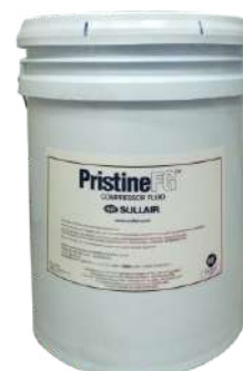
SU02250196-470 ACEITE PRISTINEX33U 5 GAL C/U