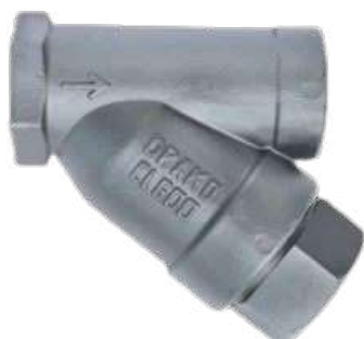
KV3.34.1.101.075.015 FILTRO Y FIG 15 BSPT 1/2