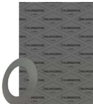
1.02.1.27.00.00.101 KLINGERSIL C 4553 MT - 1 MM