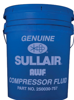
SU250030-757 ACEITE AWF 5 GAL