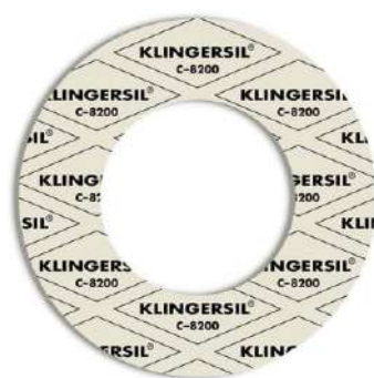
1.02.1.36.18.00.301 KLINGERSIL C 8200 - 3MM