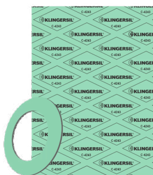
1.02.1.46.10.00.051 KLINGERSIL C 4243 - 0,5 MM