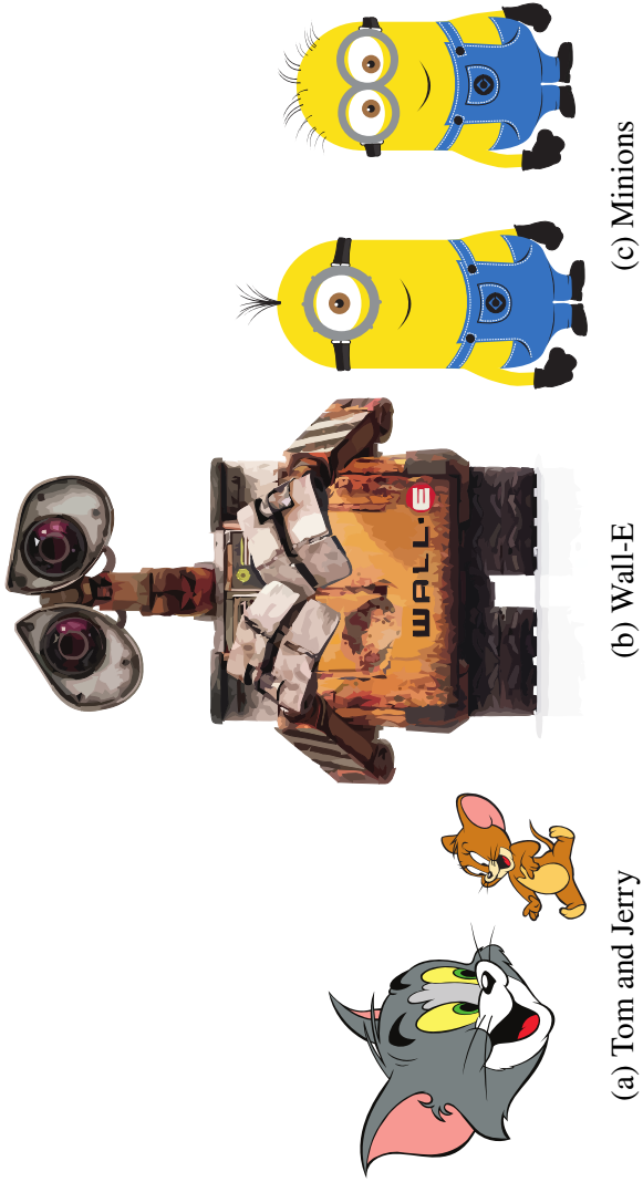
Fig. 2.2 Best Animations