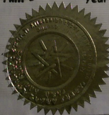
የዩኒቨርሲቲው ፕሬዝዳንት President of the University