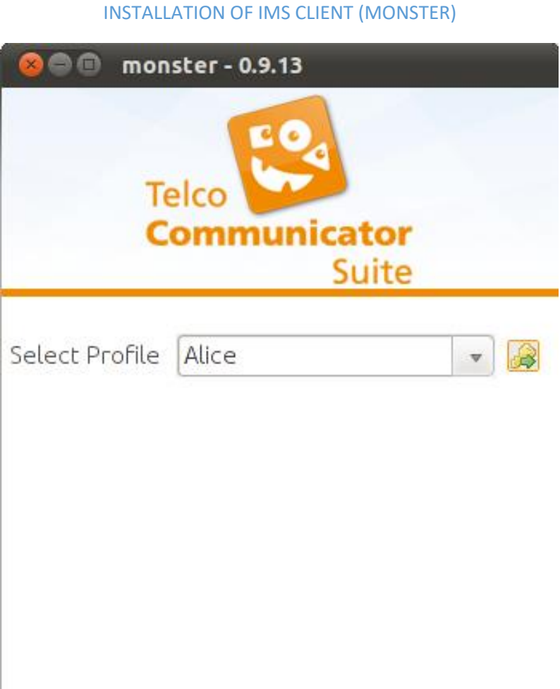
LEUK 7 INSTALLATION OF IMS CLIENT (MONSTER)