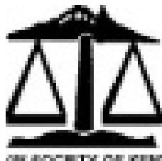
Law Society of Kenya