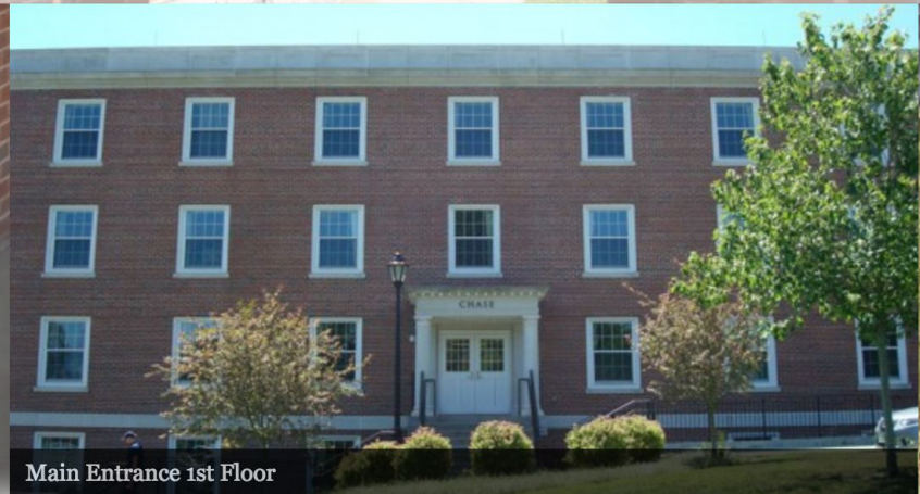
Main Entrance 1st Floor

Don't have an account? Fill out our Sub Contractor's Pre Qualification Form