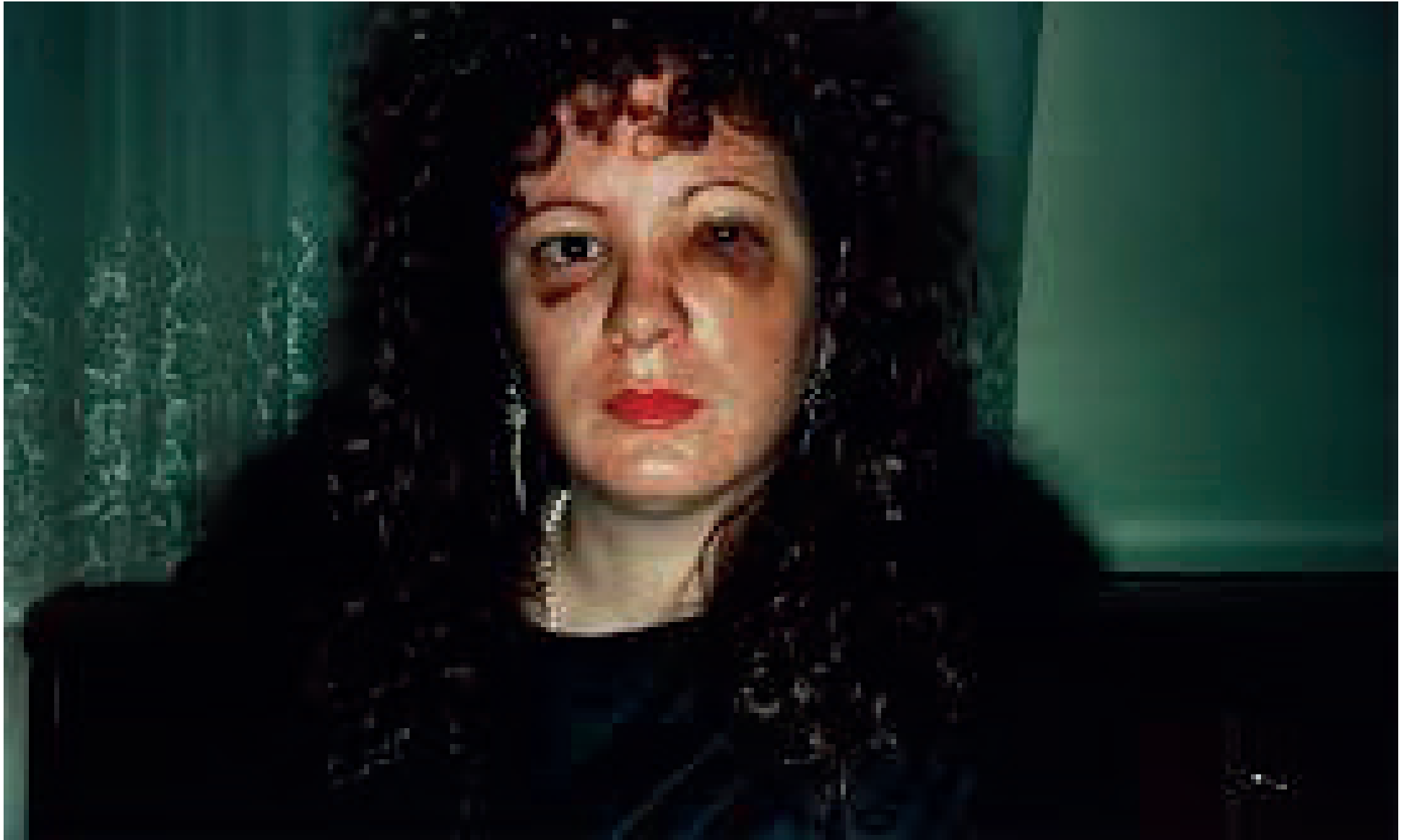
Nan Goldin -