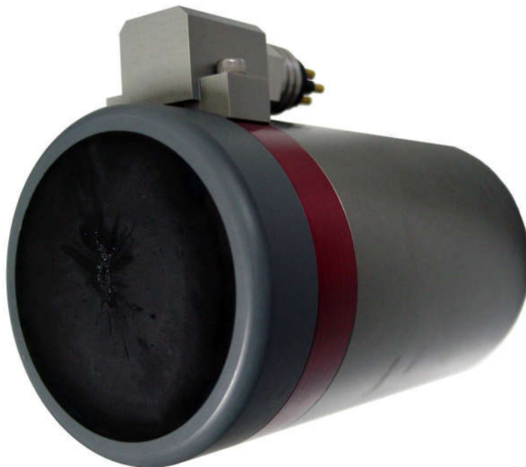
Picture shown with optional right angle connector.

The Imagenex Model 881A Echo Sounder is a completely self-contained echo sounder with a serial output. It is mounted in a pressure-proof housing with an underwater connector for use in depths up to 3000 meters (10000 feet). It can be used as a standard echo sounder or with digitized first returns only. Its requirements are minimal, needing only a power source and a digital interface to an external device such as a personal or laptop computer.