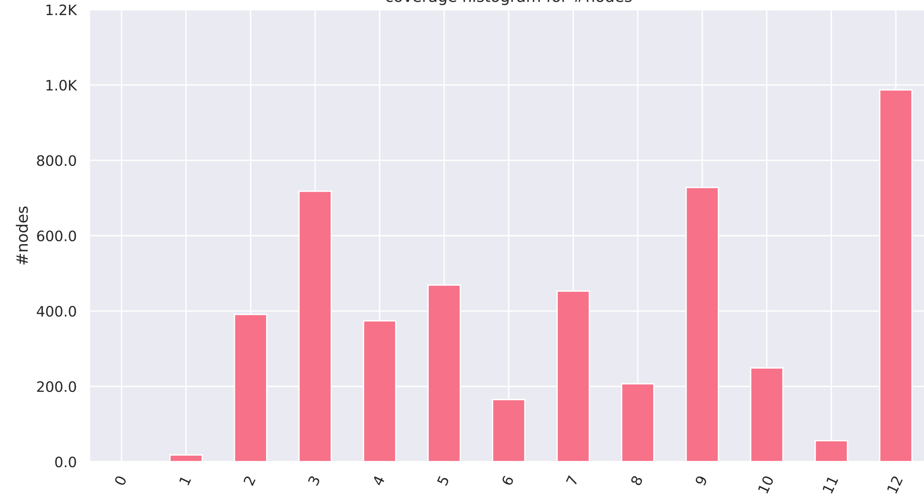
coverage histogram for #nodes