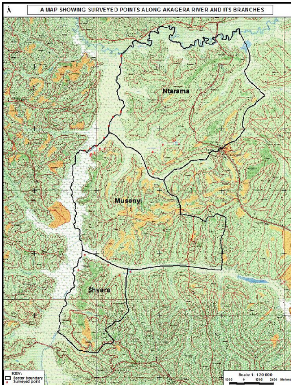
Figure 3: The surveyed sites at Akanyaru wetlands.

Our survey was conducted in three sectors of Bugesera District (Fig.3).