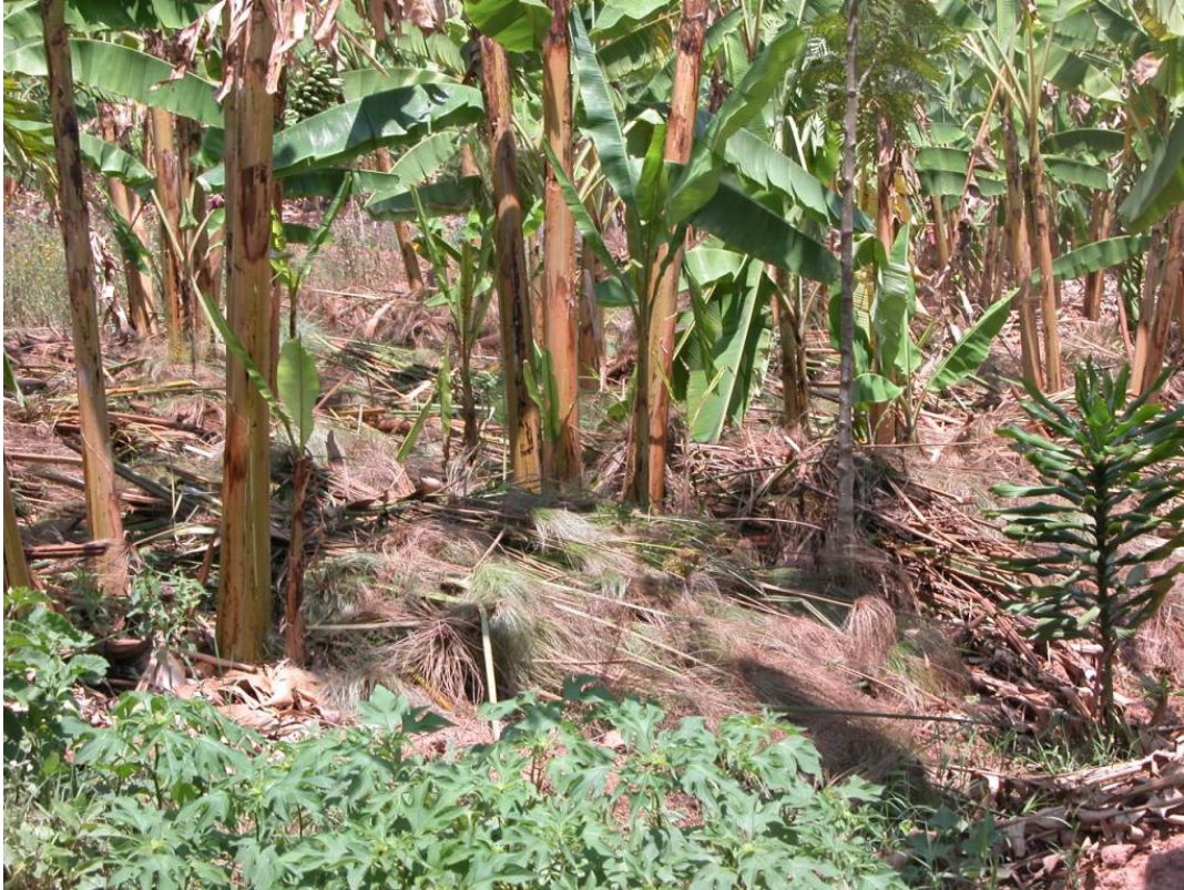
Fig. 7: Papyrus cut for mulching bananas plantation, picture by Claudien