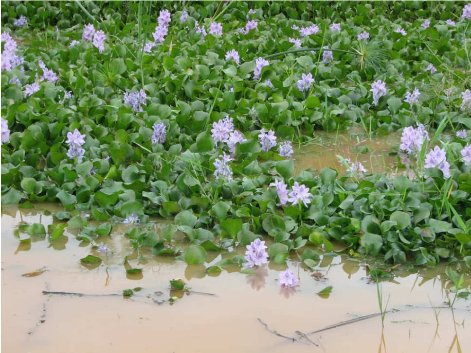
Figure 9: Water hyacinth in Akanyaru Wetlands, picture by Claudien