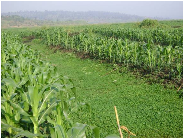
Fig. 5: A cultivated land for mazes in Akanyaru wetlands

While preparing the lands, people firstly burn or cut the vegetation to get a cultivation space (Figure 2). Through these activities, the biodiversity is destroyed and particularly, animals are dislodged and some time caught. Fire also kills the immature animals and destroys nests of birds. Agricultural activities are also reducing the stretch of the swamp and, thus, reduce the optimum space for the survival of certain species of large territory.