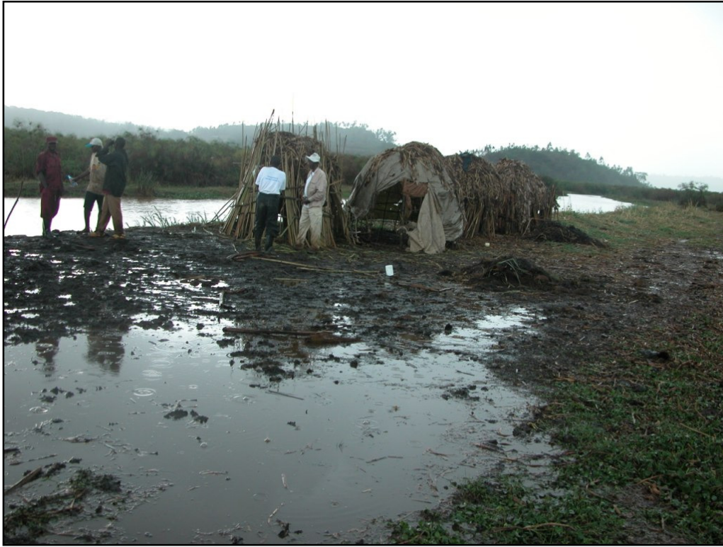
Figure 8: Calf's houses along Akanyaru River