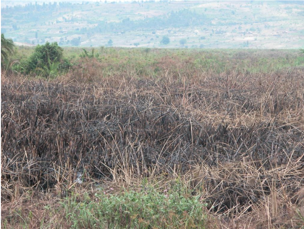
Figure 6: Papyrus burning at Akanyaru Wetlands