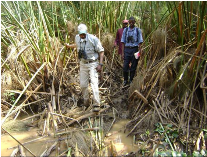
Fig. 1: ACNR CEO, a student Jean Apul and a Local guide crossing the Akanyaru wetlands

Points were established at an interval of 200m along the transect in four sites. A point is a single station from which a count is made and each point in this study was visited three times. At each point observers waited for 3 minutes to allow birds settle down and then recorded all sightings and calls of birds for a period of 10 minutes (Sutherland, W. 2000). We then moved on to the next point and repeated this same process. The data were used to produce a bird checklist and to document the threatened species. GPS readings and altitude were taken for each point where it was possible to help map the points and estimating the remaining area of Papyrus (Table 1).