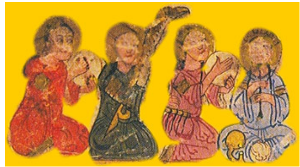
Al-Jazari's programmable automata (1206 CE)

Realistic humanoid automatons were built by craftsman from every civilization, including Yan Shi, [9] Hero of Alexandria, [10] Al-Jazari [11] and Wolfgang von Kempelen. [12] The oldest known automatons were the sacred statues of ancient Egypt and Greece. The faithful believed that craftsman had imbued these figures with very real minds, capable of wisdom and emotion. Hermes Trismegistus wrote that "by discovering the true nature of the gods, man has been able to reproduce it." [13] [14]