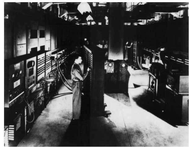
The ENIAC, at the Moore School of Electrical Engineering.

In the 1940s and 50s, a handful of scientists from a variety of fields (mathematics, psychology, engineering, economics and political science) began to discuss the possibility of creating an artificial brain. The field of artificial intelligence research was founded as an academic discipline in 1956.