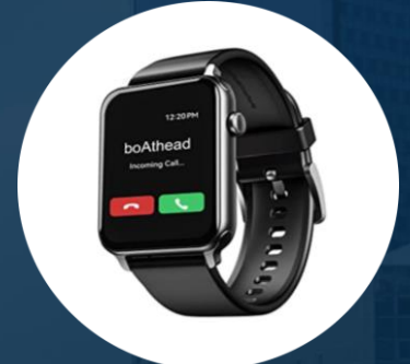
boAt Blaze Smart Watch