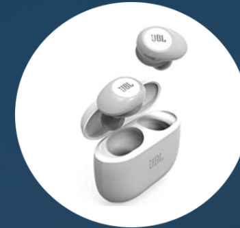
JBL Tune 125TWS