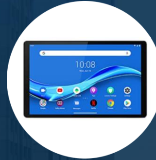
Lenovo M10 FHD Plus (2nd Gen)