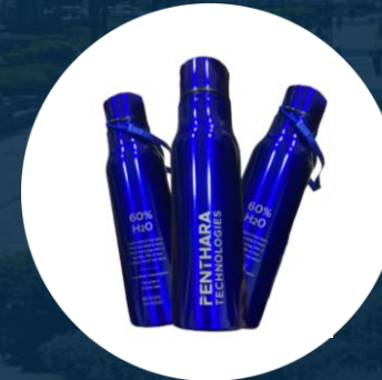
Cool Water Bottle