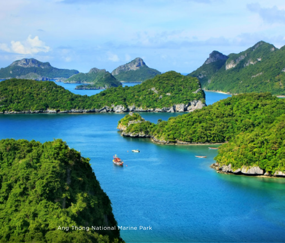
Ang Thong National Marine Park