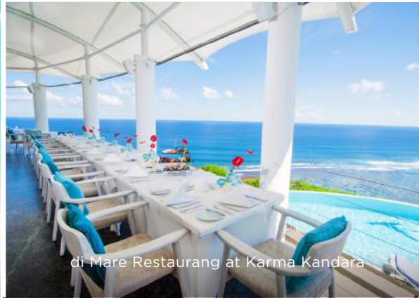
di Mare Restaurant at Karma Kandara