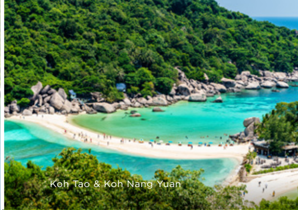
Koh Tao & Koh Nang Yuan