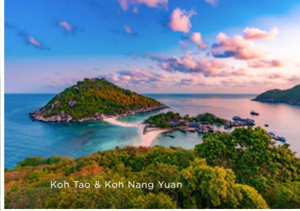
Koh Tao & Koh Nang Yuan