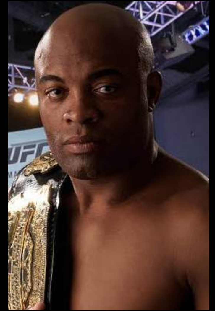
SPECIAL CELEBRITY GUEST ANDERSON SPIDER SILVA