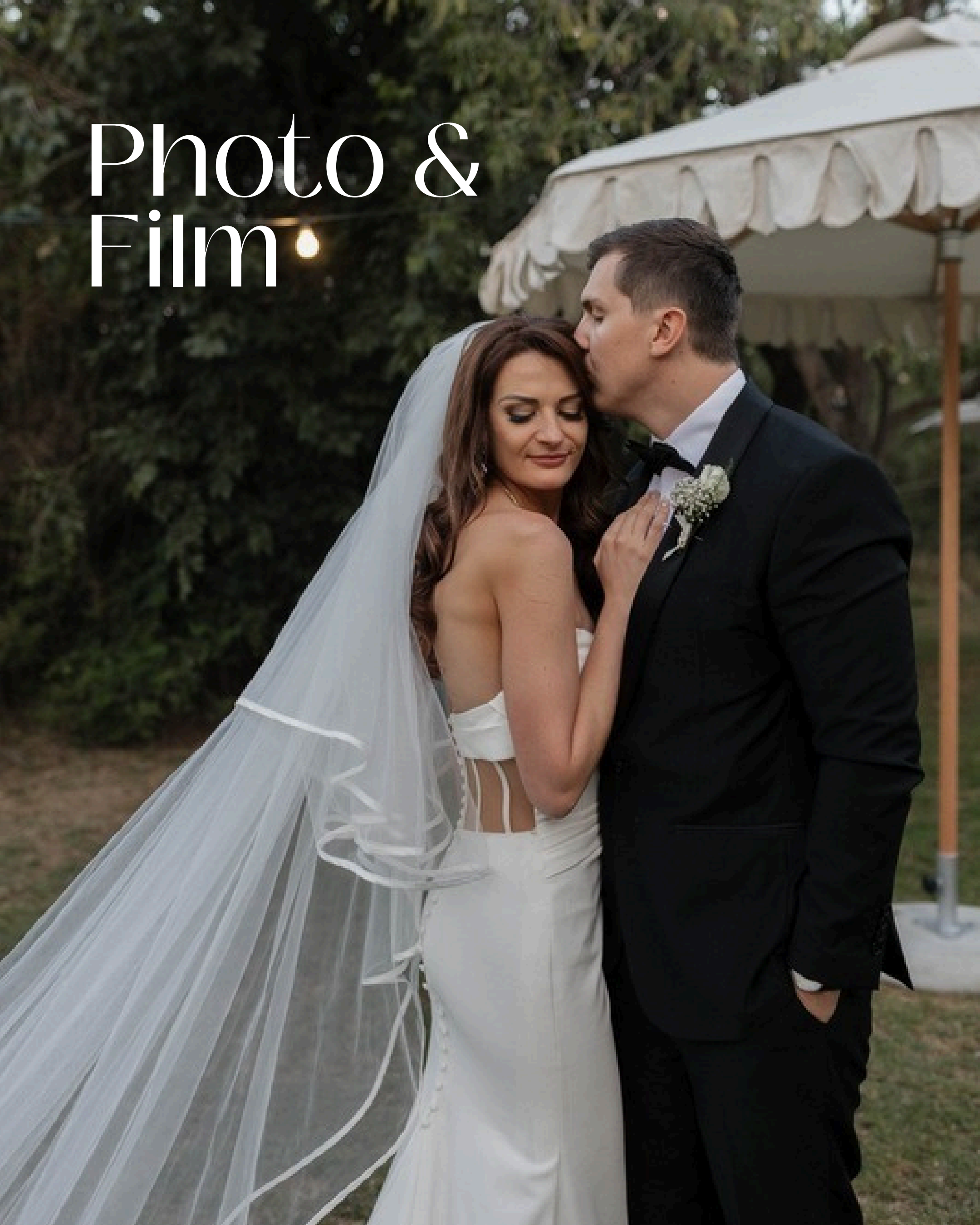
Photo & Film