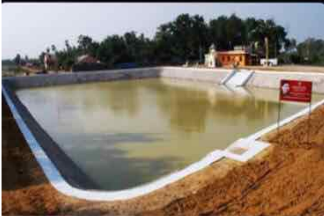
Bugana, Haryana , 125121, India Lat 29.1491935° long 75.721646° 11/06/2025 4:30 PM GMT +05:30