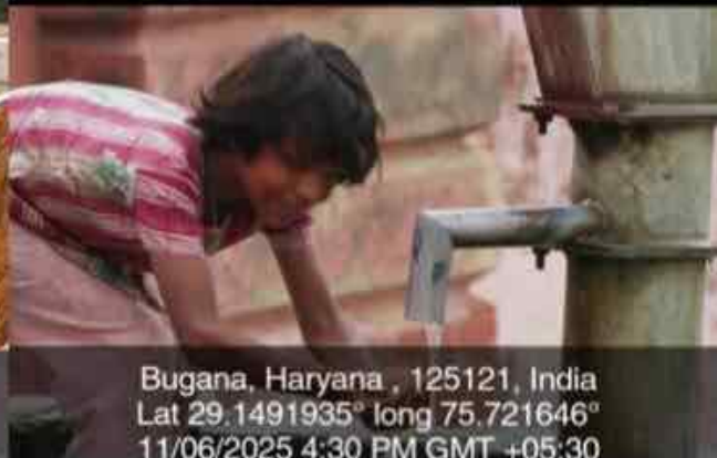
Bugana, Haryana , 125121, India Lat 29.1491935° long 75.721646° 11/06/2025 4:30 PM GMT +05:30