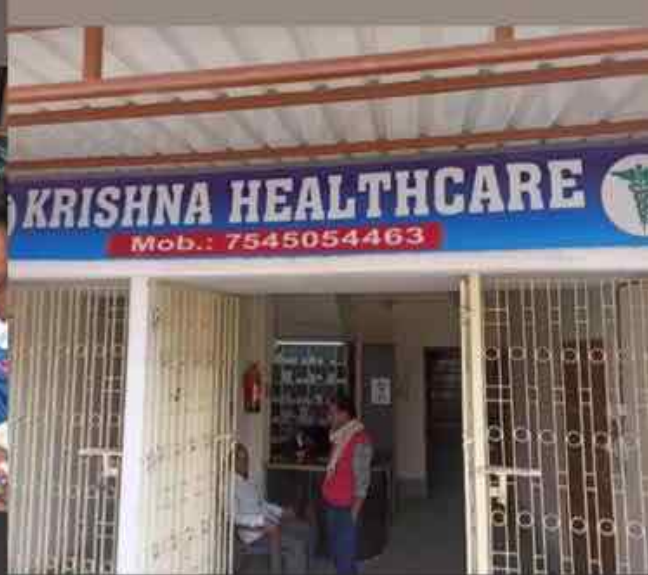
Bugana, Haryana, 125121, India Lat 29.149135 Long 75.721646° 12/06/2025 12:30 PM GMT +05:30