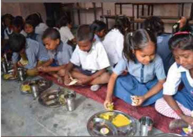
Bugana, Haryana, 125121, India. Lat 29.149135° long 75.721646° 13/06/2025 11:30 AM GMT+05:30