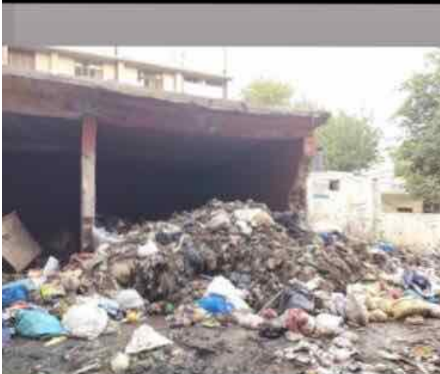
Bugana, Haryana, India Bugana, Haryana 125121, India Lat 29.1491935° Long 75.721646 10/06/2025 10:05AM GMT +05:30