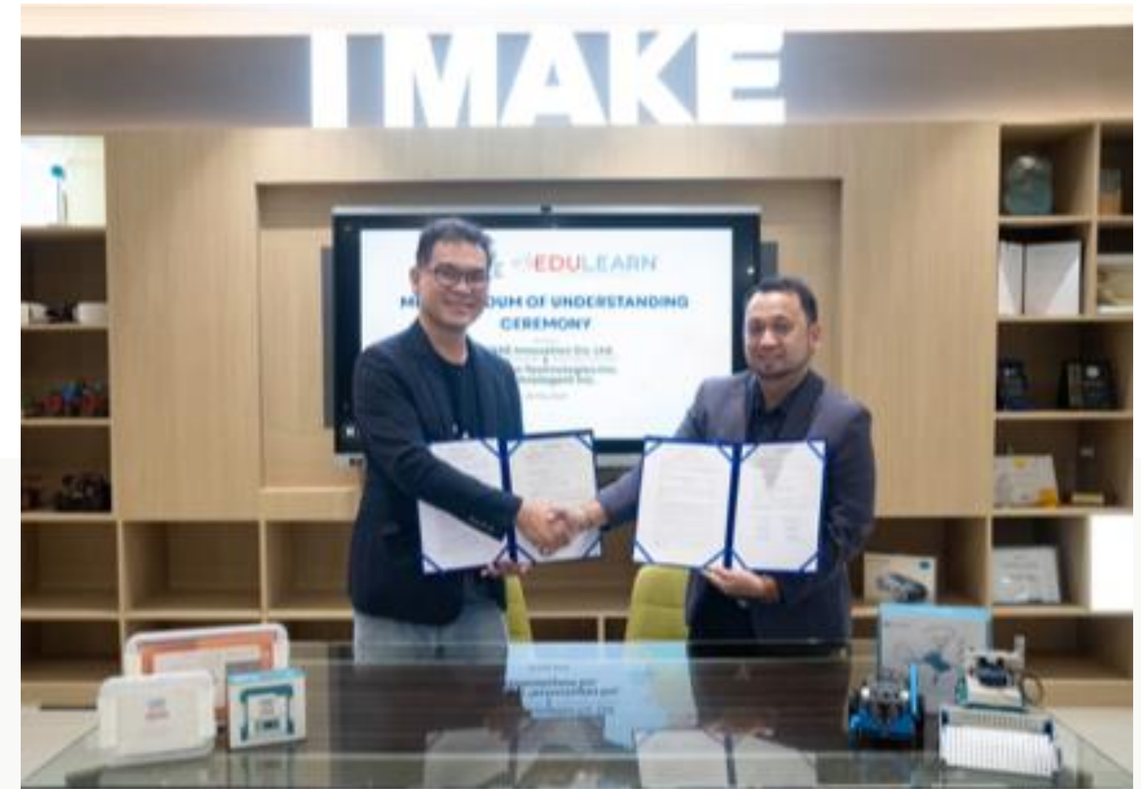
iMAKE Innovation Co., Ltd. (Imagineering Thailand)