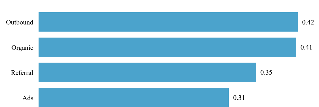
Funnel Customers by Stage