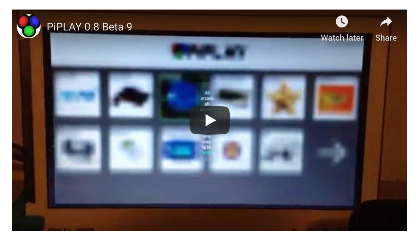
Watch 'PiPLAY 0.8 Beta 9' on YouTube

Featuring 12 emulated machines plus the ScummVM point-and-click adventure game platform, PiPlay is the compact alternative to RetroPie and RecalBox. You can download PiPlay and write it to a microSD card, or install directly to your Raspberry Pi via GitHub.