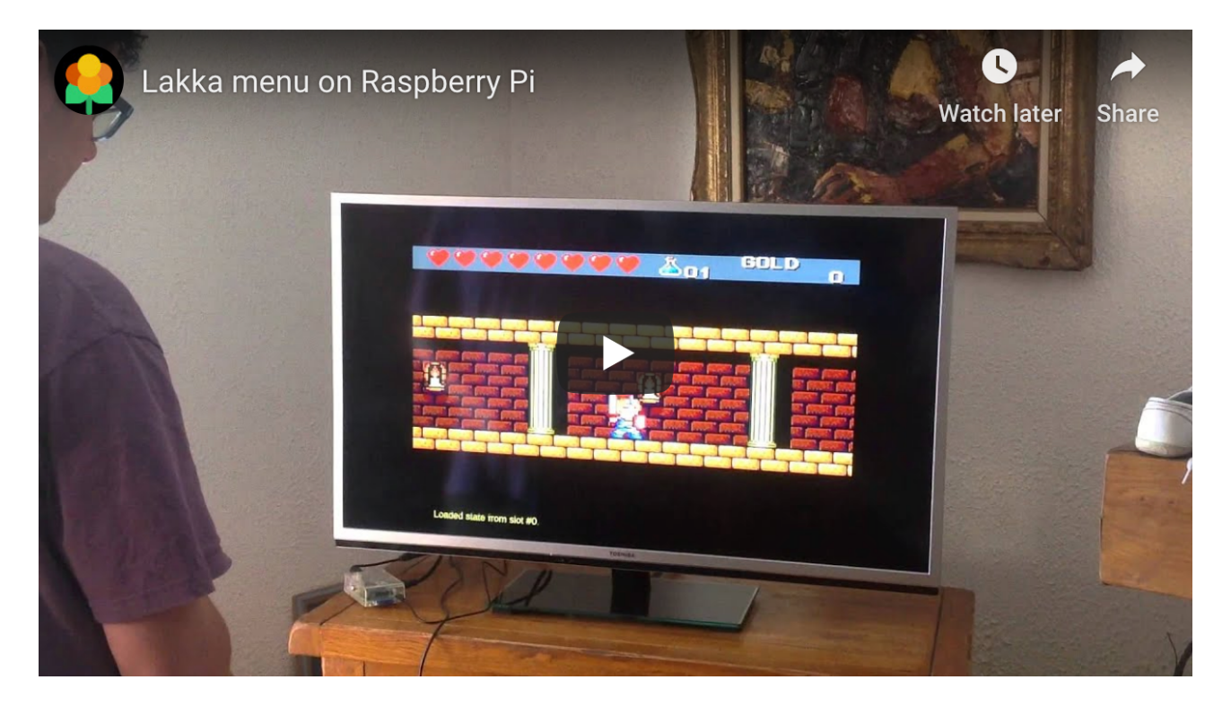
Watch 'Lakka menu on Raspberry Pi' on YouTube

Describing itself as "a lightweight Linux distribution that transforms a small computer into a full-blown emulation console," Lakka also uses RetroArch. Supporting around 40 emulators with thousands of games, Lakka is a strong alternative to RetroPie and RecalBox.