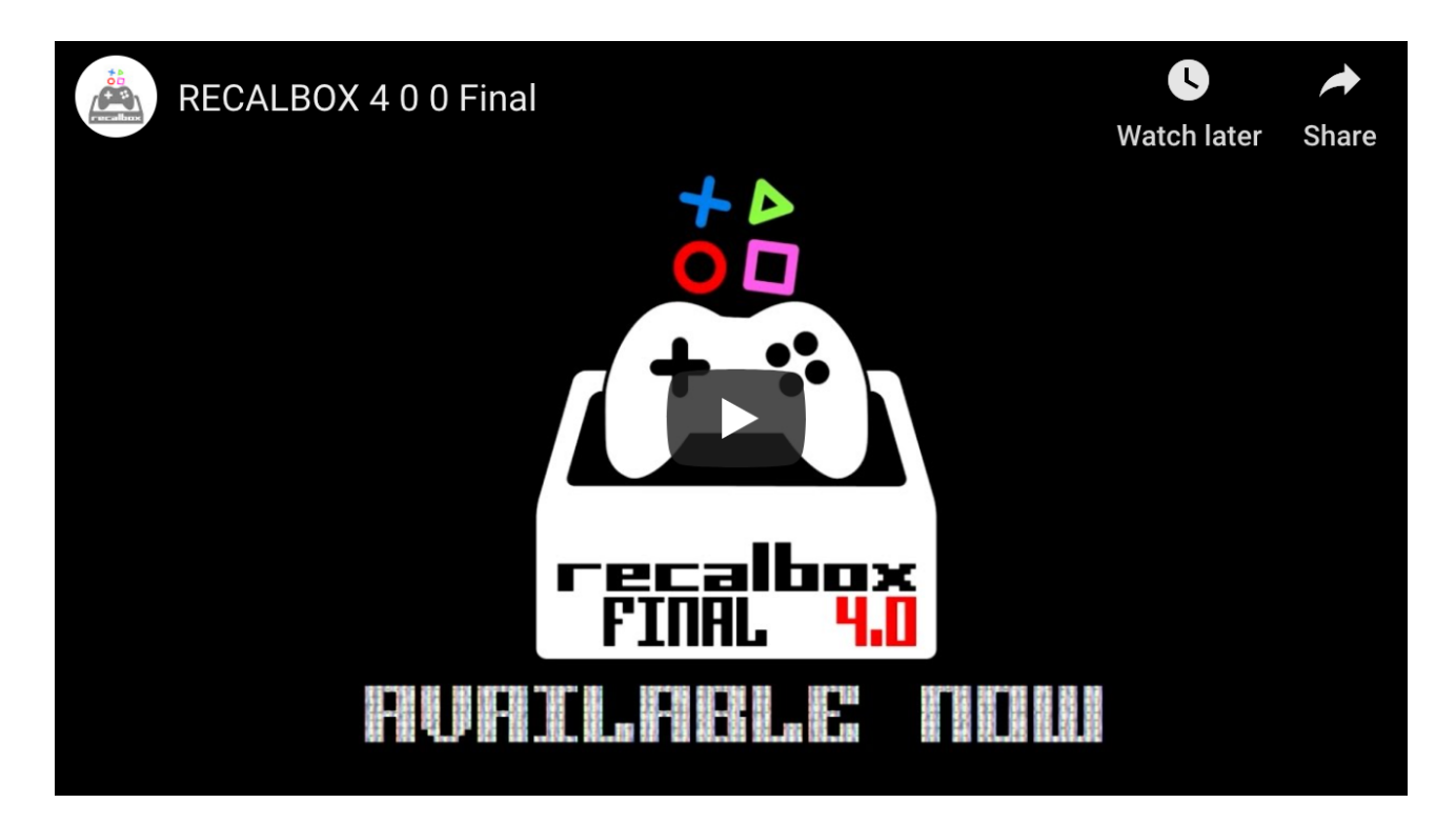
Watch 'RECALBOX 4 0 0 Final' on YouTube

RecalBox supports over 40 emulators, including MAME, and in excess of 30,000 titles. Again, using the EmulationStation UI, and with emulation support from RetroArch/libretro.