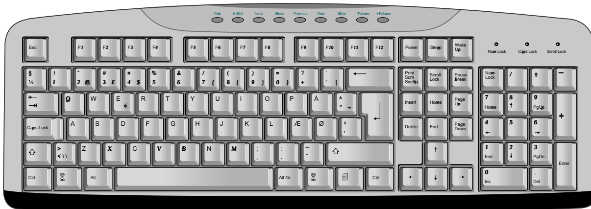
Figure 2: This figure floats to the top of the page, spanning both columns.