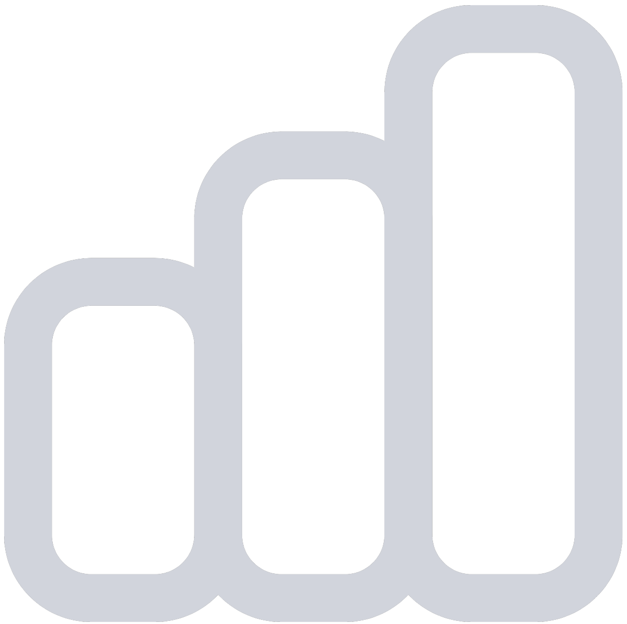
Chart Area - Ready for Integration