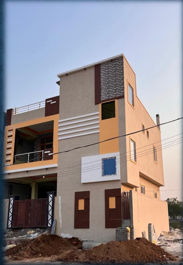
G +1 Gandimaisamma