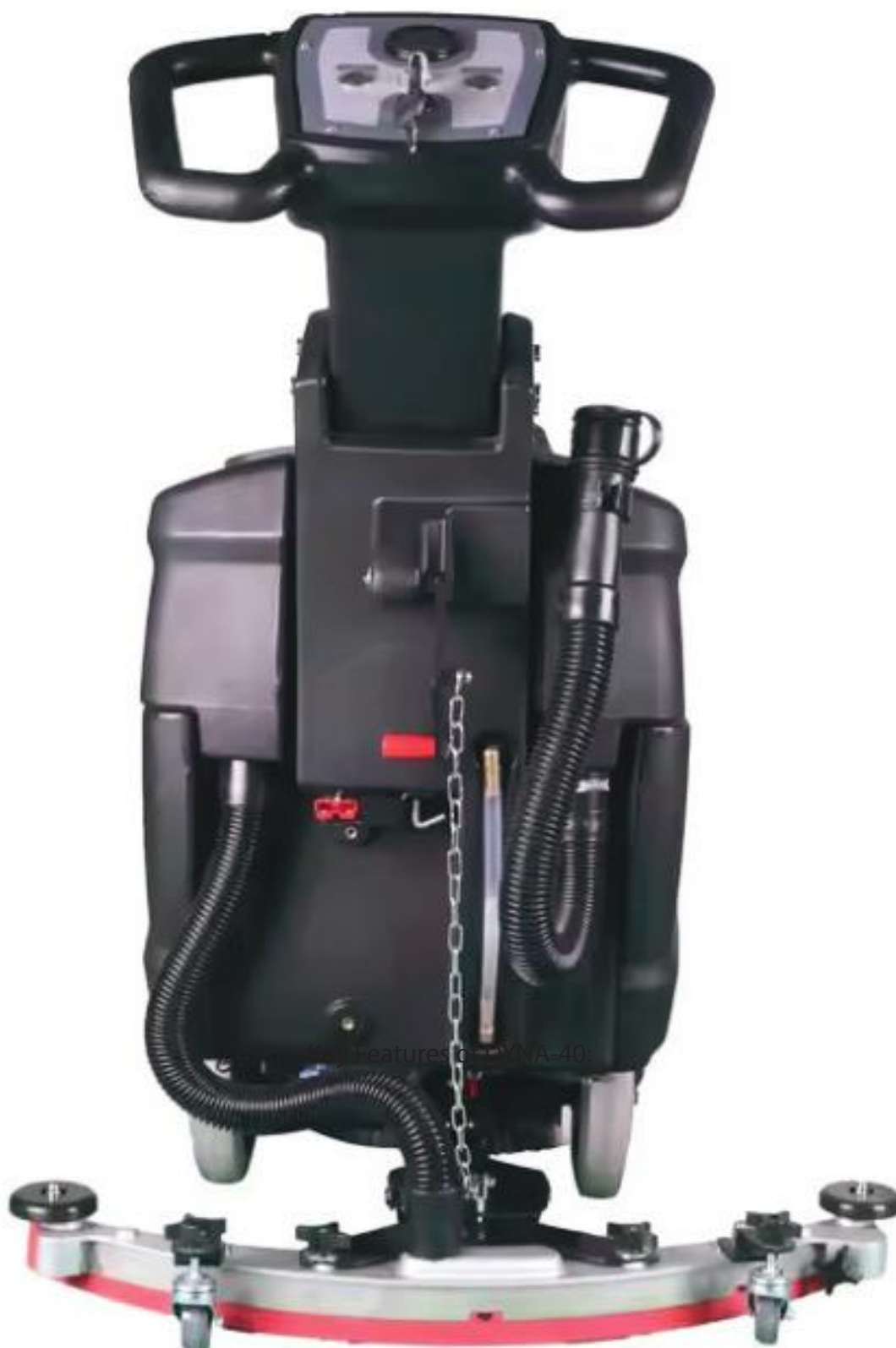
Key Features of VNA-40:

Compact Design, High Capacity, and Advanced Technology for Effortless Floor Maintenance