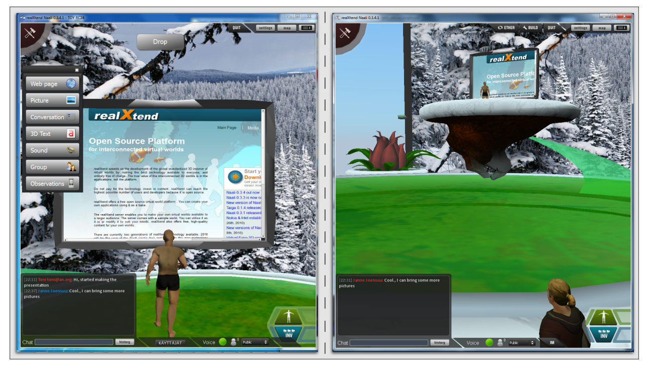
Two Naali clients stand nearby and view the presentation stage of the TOY system, an open source learning environment for the Future School of Finland project. The one on the left just added a web page to the stage, and is currently carrying the object.

No matter how the presentation view is made, the presenter typically needs the same controls. In Second Life, avatar controls are fixed and, to control a presentation, one might need to create a presentation sequence object with mouse click controls to press virtual buttons. In realXtend, custom controls in the client can directly change the shared scane state.