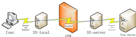
Figure 1. Communication Principle of Shadowsocks.