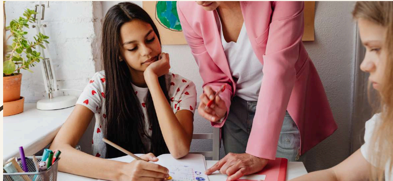
Senior High School 56 Jakarta

My high school was a Social Studies program 2013-2016