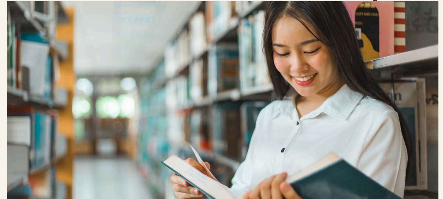
Krida Wacana Christian University

My high school was a Social Studies program 2013-2016