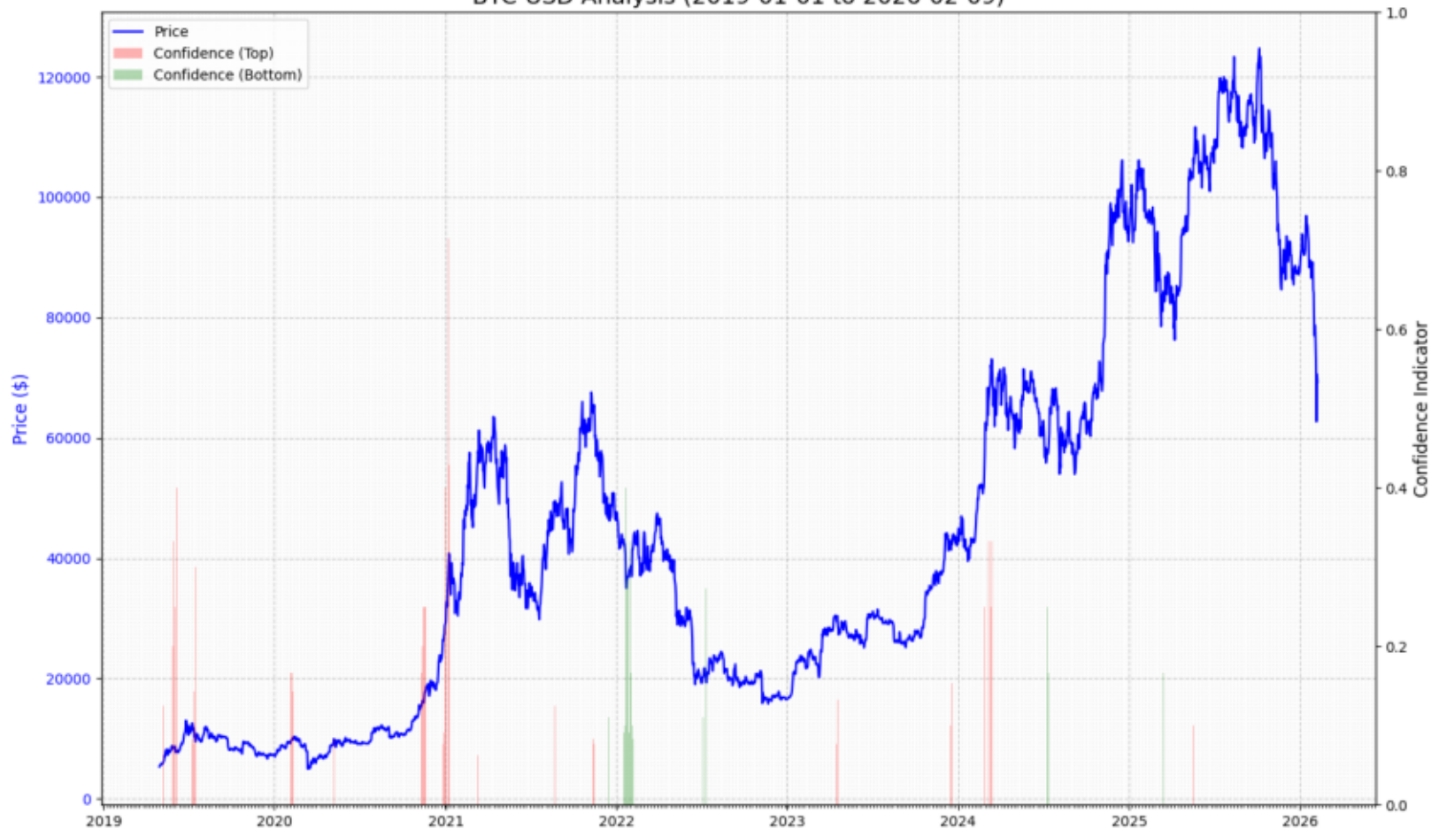
BTC-USD Analysis (2019-01-01 to 2026-02-09)