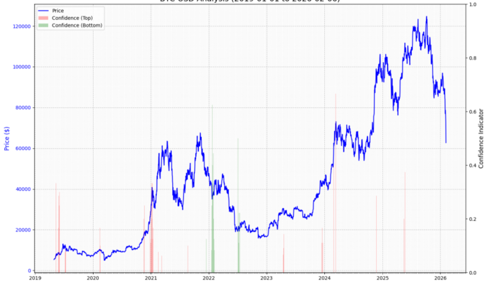
BTC-USD Analysis (2019-01-01 to 2026-02-06)