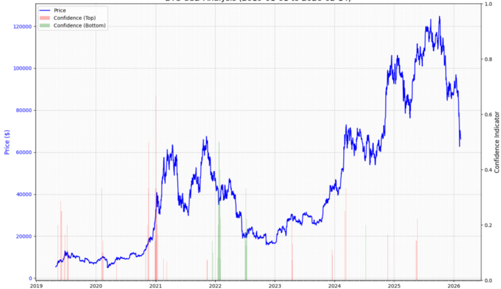
BTC-USD Analysis (2019-01-01 to 2026-02-14)