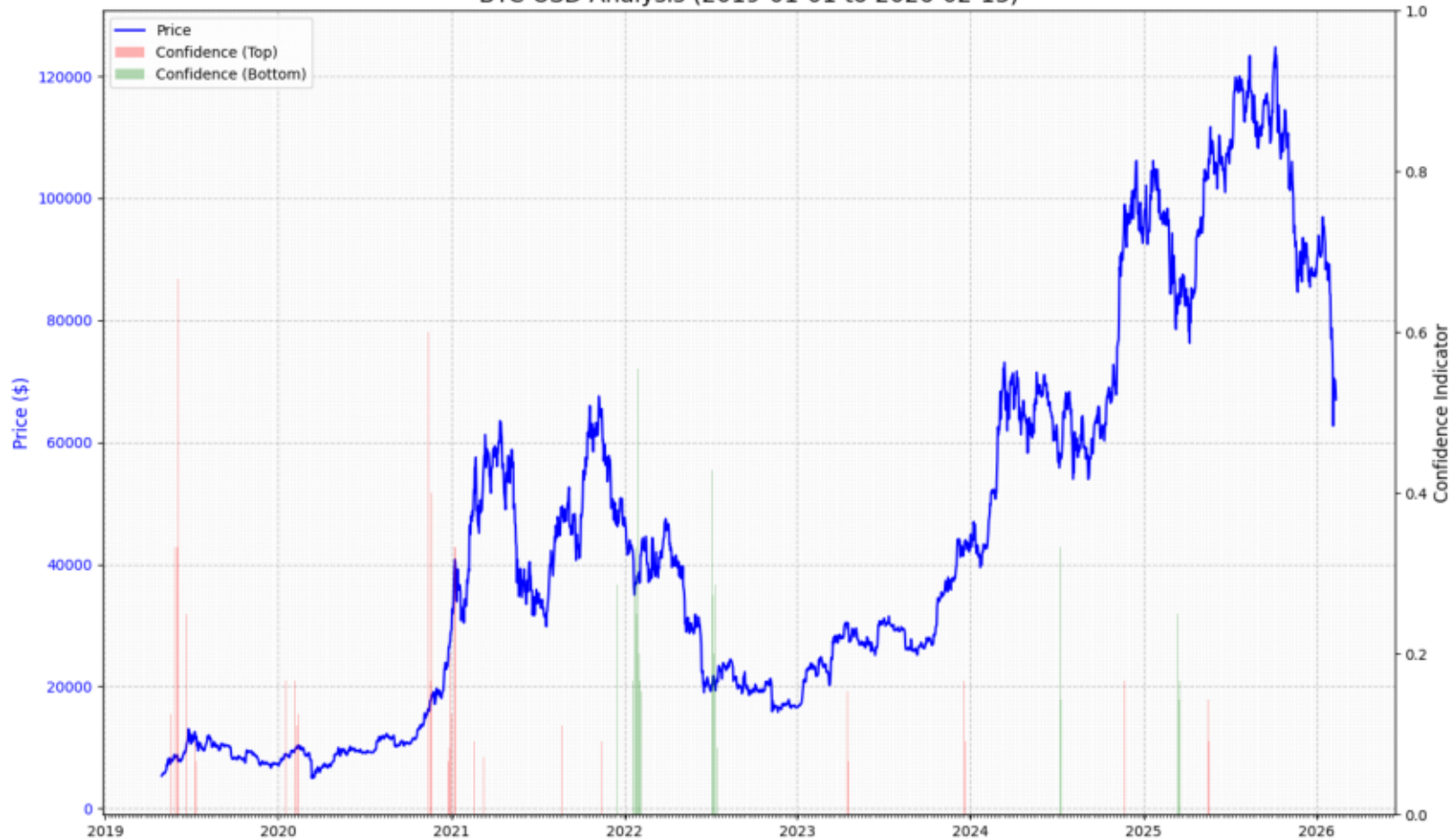
BTC-USD Analysis (2019-01-01 to 2026-02-13)