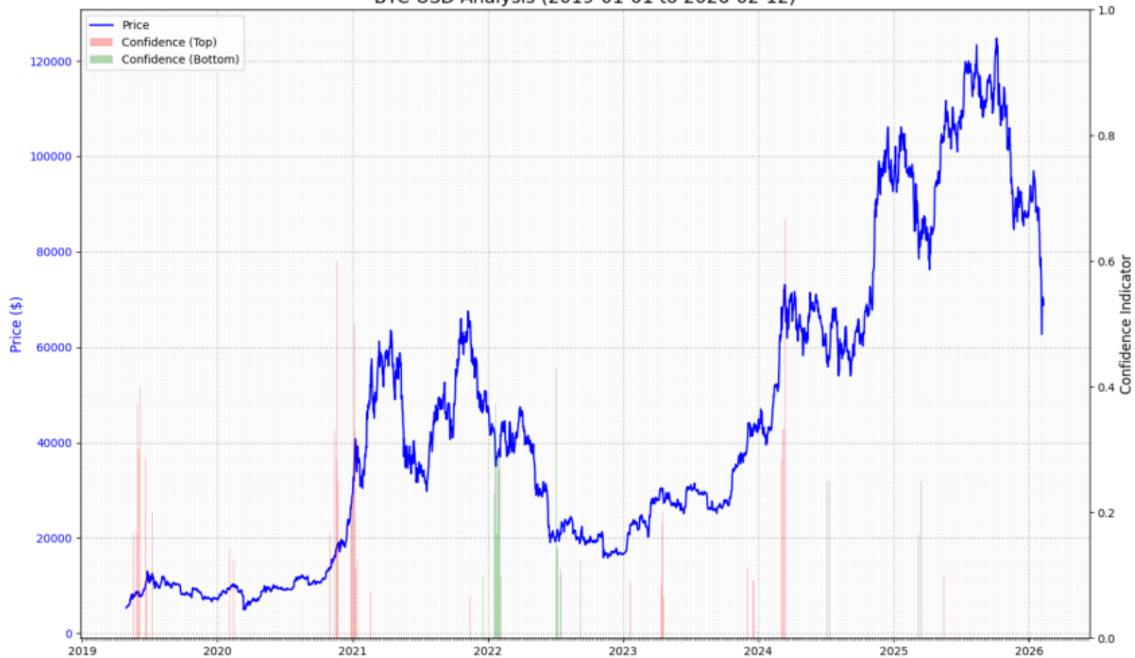
BTC-USD Analysis (2019-01-01 to 2026-02-12)