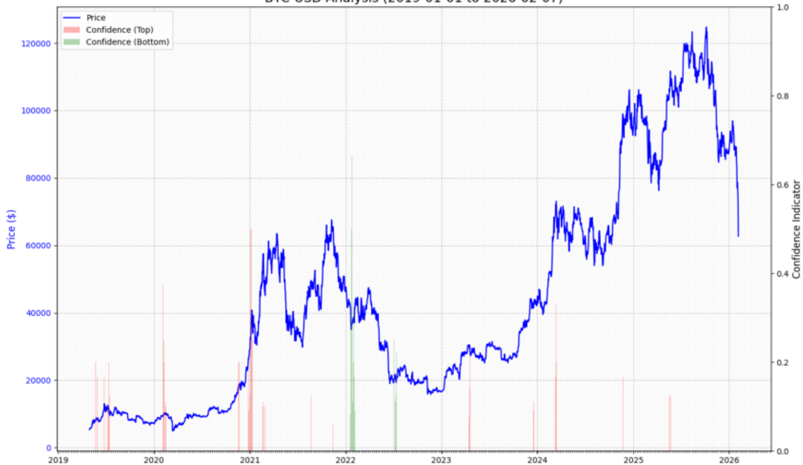
BTC-USD Analysis (2019-01-01 to 2026-02-07)