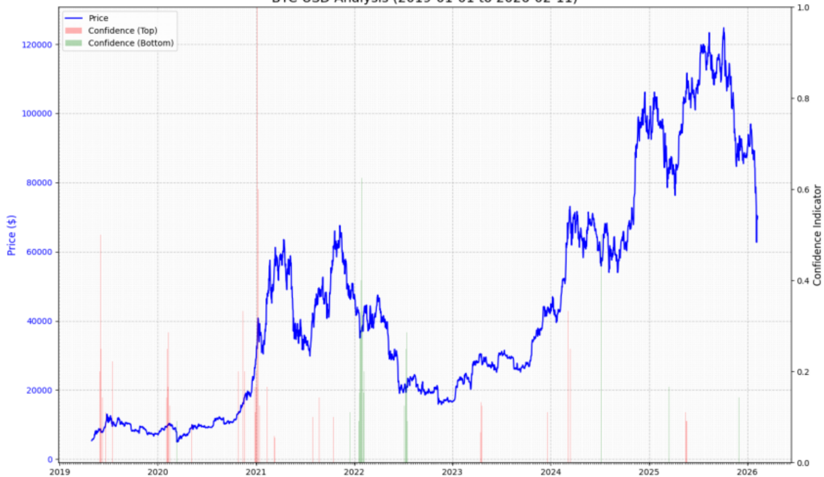
BTC-USD Analysis (2019-01-01 to 2026-02-11)