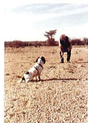
Karenswood (International) Ltd Mine Detector Dog Teams in operation