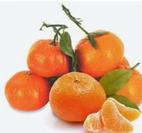
有葉橘 Mandarin With Leaves