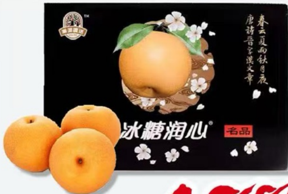
秋月梨禮盒 Brown Asian Pear 3.5kg