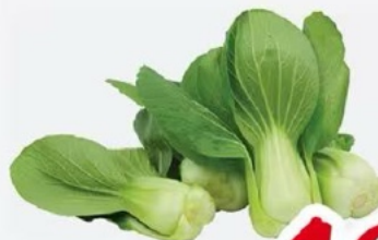
上海苗 Shanghai Bok Choy Miu Mexico Reg. $2.59LB