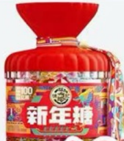
徐福記 新年糖 Hsu Fu Chi Year Candy 420g Reg. $17.99/EA