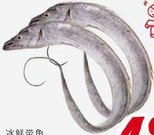
冰鲜带鱼 FRESH CHILLED HAIRTAIL FISH Reg. $5.99/LB

ONLY Friday, Saturday & Sunday (2/13-2/15) 仅周五六日哦!