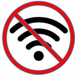
Wi-Fi stereos/radios are not permitted

There is also a need to check that the stereos/radios purchased operate on Bluetooth only and not on Wi-Fi – this is easily done by looking at the box and checking that there is no reference to Wi-Fi. You can also check that there is only the Bluetooth symbol and not the Wi-Fi symbol as below.