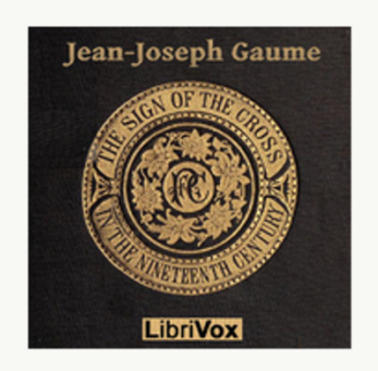
Download cover art Download CD case insert