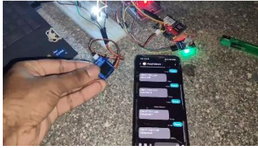
Figure 3. Successful SMS notification

The GSM module, connected to a 2G network, was able to send SMS alerts to the user's phone. However, due to limited 2G network availability, connectivity issues were encountered, resulting in occasional delays or failures in message transmission.