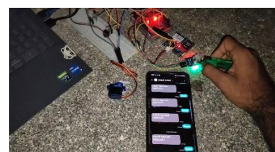
Figure 2. Lighter as a gas source

The MQ-2 gas sensor accurately detected gas presence, with typical readings ranging from 120-50 in a normal environment and increasing significantly when gas from the lighter was introduced. The sensor responded quickly to elevated gas levels, enabling prompt leak detection.