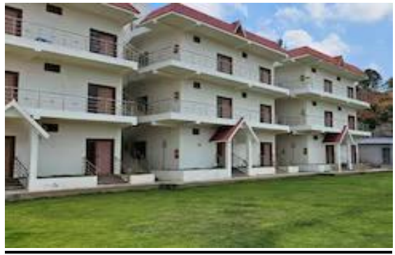
Nature Trails Yelagiri Hills

2 Km from yelagiri lake and 3 km from Nilavoor