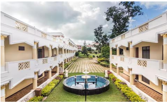
Hotel Land Mark Boat House Road, Athanavur, Yelagiri Hills