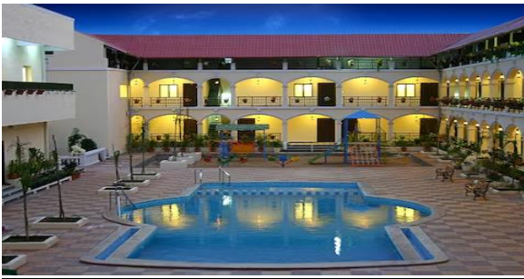
Kumara Raja Palace Athanavur, Yelagiri Hills