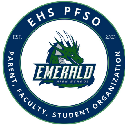
EHS Parent Faculty Student Organization