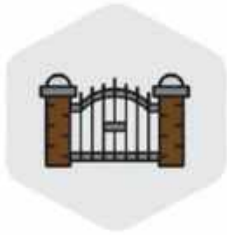
GATED AND WALLED SECURITY