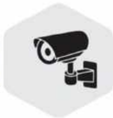
24 X 7 SECURITY