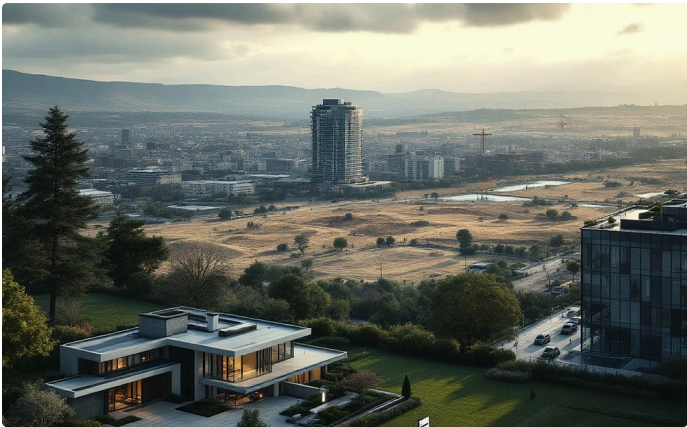
Properties Recently Joined