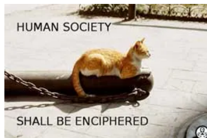
Ethscription 0, May 26th 2019

I had the idea for mfpurrs when I saw the first Ethscription ever , which is a cat peering out on society, plotting its downfall. I loved it and knew I had to meme it.