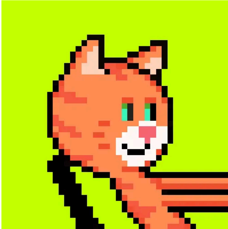
mfpurr base model