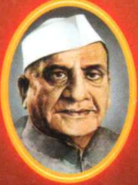
Dr. Panjabrao alias Bhausaheb Deshmukh Founder President